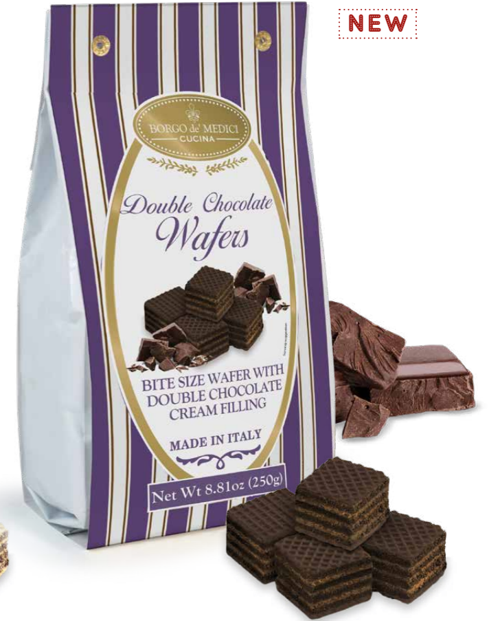
BH2324 DOUBLE CHOCOLATE WAFERS 8.8 oz (250 g) 12 unit/case