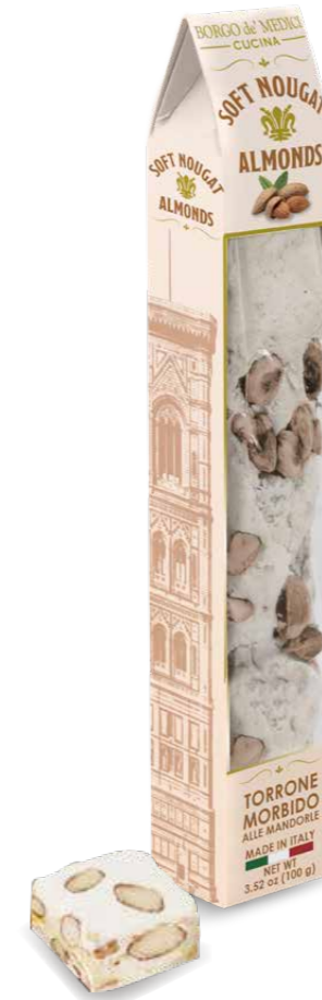
BH2129 SOFT NOUGAT BAR WITH ALMONDS 3.5 oz (100g) 12 units/case