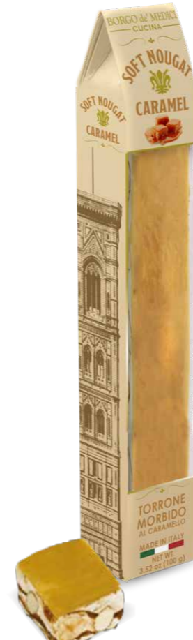
BH2128 SOFT NOUGAT BAR WITH CARAMEL 3.5 oz (100g) 12 units/case