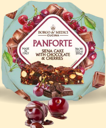
BH2220 PANFORTE CAKE CHOCOLATE & CHERRIES in shelf tray 3.5 oz (100g) 10 units/case