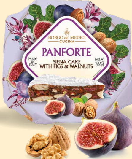
BH2221 PANFORTE CAKE WITH FIGS & WALNUTS in shelf tray 3.5 oz (100g) 10 units/case