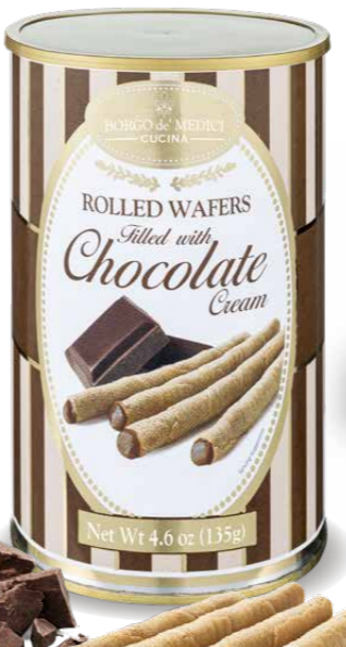
AS02246 CHOCOLATE ROLLED WAFERS 4.76 oz (135 g) 12 units/case