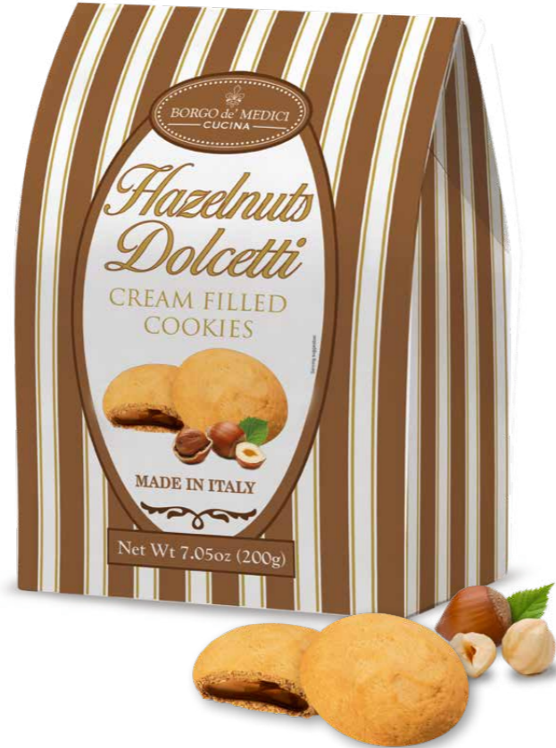
AS02250 HAZELNUTS DOLCETTI 7.0 oz (200 g) 12 units/case