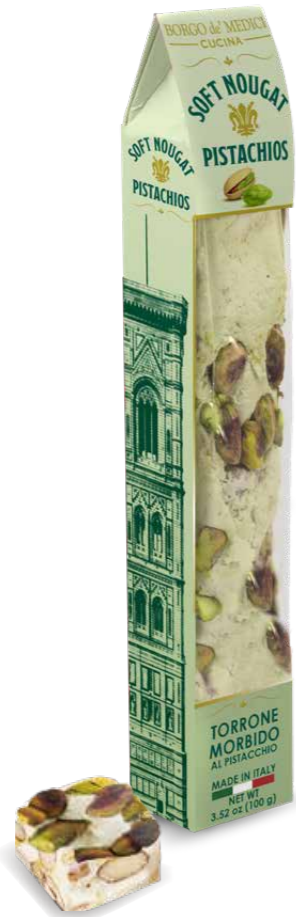
BH2125 SOFT NOUGAT BAR WITH PISTACHIOS 3.5 oz (100g) 12 units/case