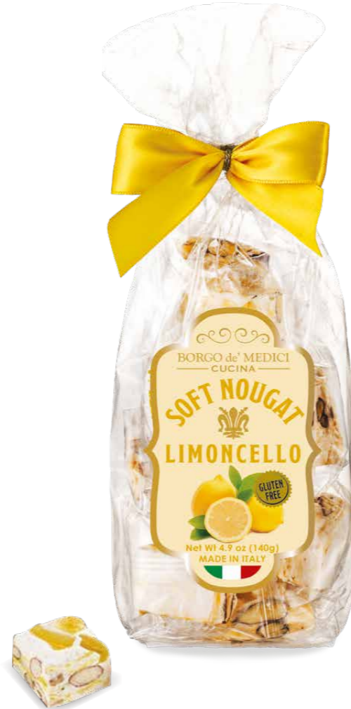
BH2132 LIMONCELLO SOFT NOUGAT BITE IN BAG 4.9 oz (140 g) 8 units/case