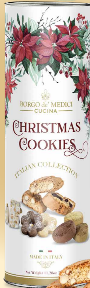
BH2320 CHRISTMAS ASSORTED COOKIES 300g 12 unit/case

Elegant, hand packed tubes embrace our Italian Biscotti "must have" for holidays. Traditional Biscotti, Almond for classics, Chocolate for the greedies, Limoncello flavored cookies and Crunchy Amaretti presented as a wonderful gift for the holiday.