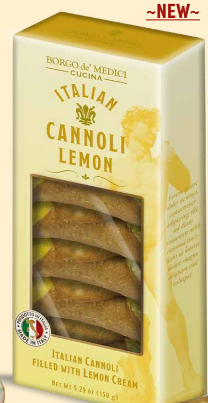
BH2407 CANNOLI LIMONE CREAM 150g 8 units/case