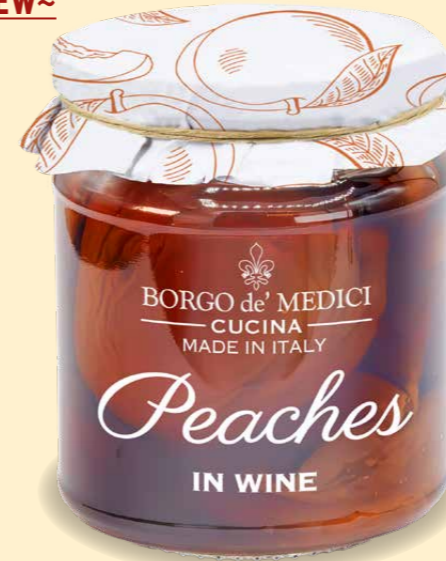
BH2436 PEACHES IN ITALIAN RED WINE 11.28 oz (320 g) 6 units/case

The best peaches and apricots, selected with meticulous care from our harvests, made even more refined and precious by the addition of extremely delicious Italian wine, such as Moscato.