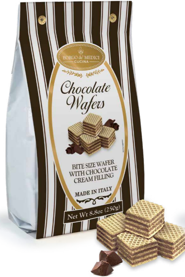
BH2229 CHOCOLATE WAFERS 8.8 oz (250 g) 10 units/case