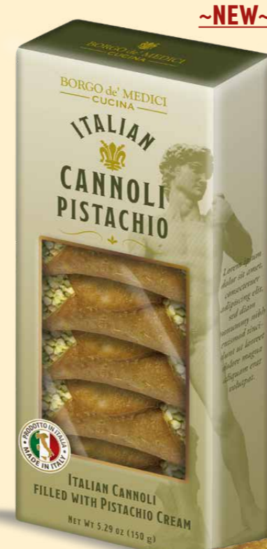
BH2409 CANNOLI PISTACHIO CREAM 150g 8 units/case