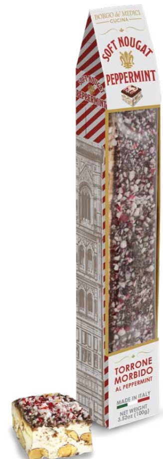
BH2303 SOFT NOUGAT WITH PEPPERMINT BARK 3.5 oz (100g) 12 unit/case