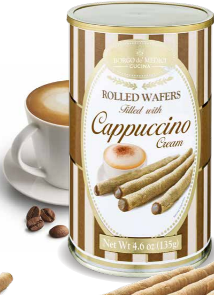
AS02247 CAPPUCCINO ROLLED WAFERS 4.76 oz (135 g) 12 units/case