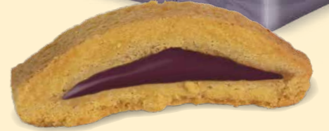
BH2415 BLACKBERRY JAM FILLED SOFT BISCOTTI 200g 8 units/case