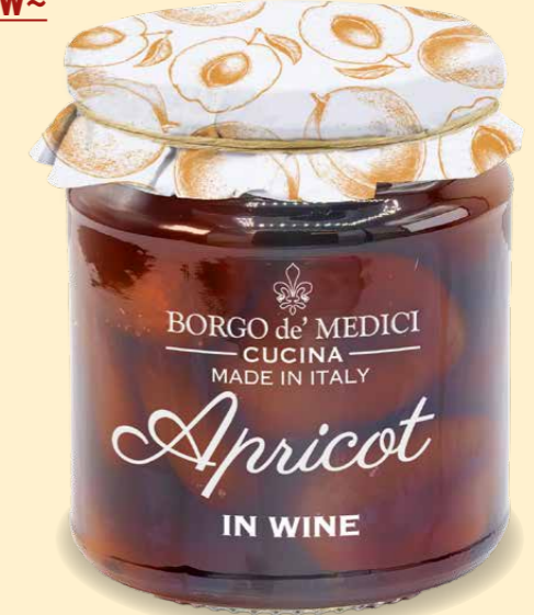
BH2435 APRICOTS IN ITALIAN RED WINE 12.34 oz (350 g) 6 units/case