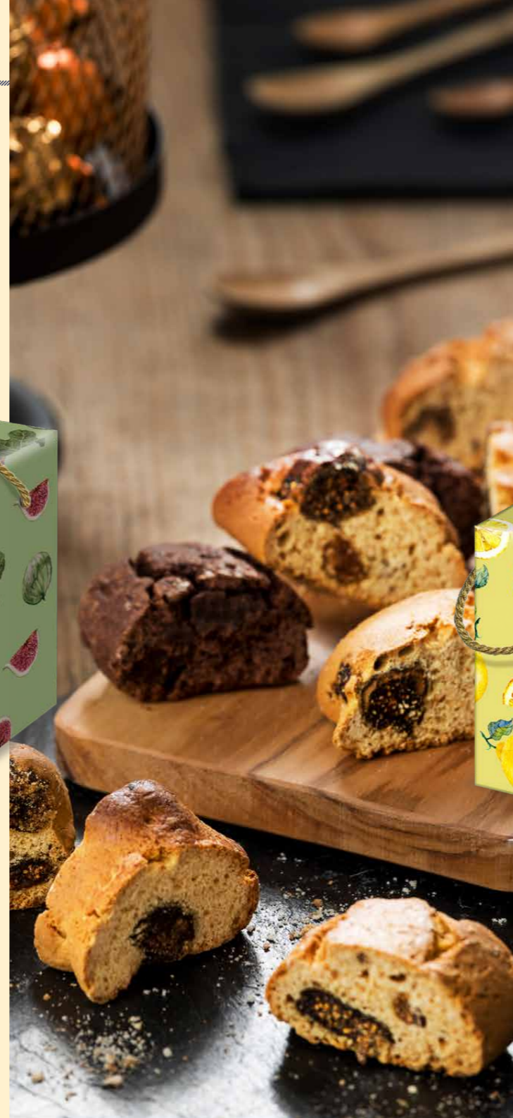
A050314 DRIED FIGS SOFT BAKED BISCOTTI IN BOX 7 oz (200 g) 12 units/case