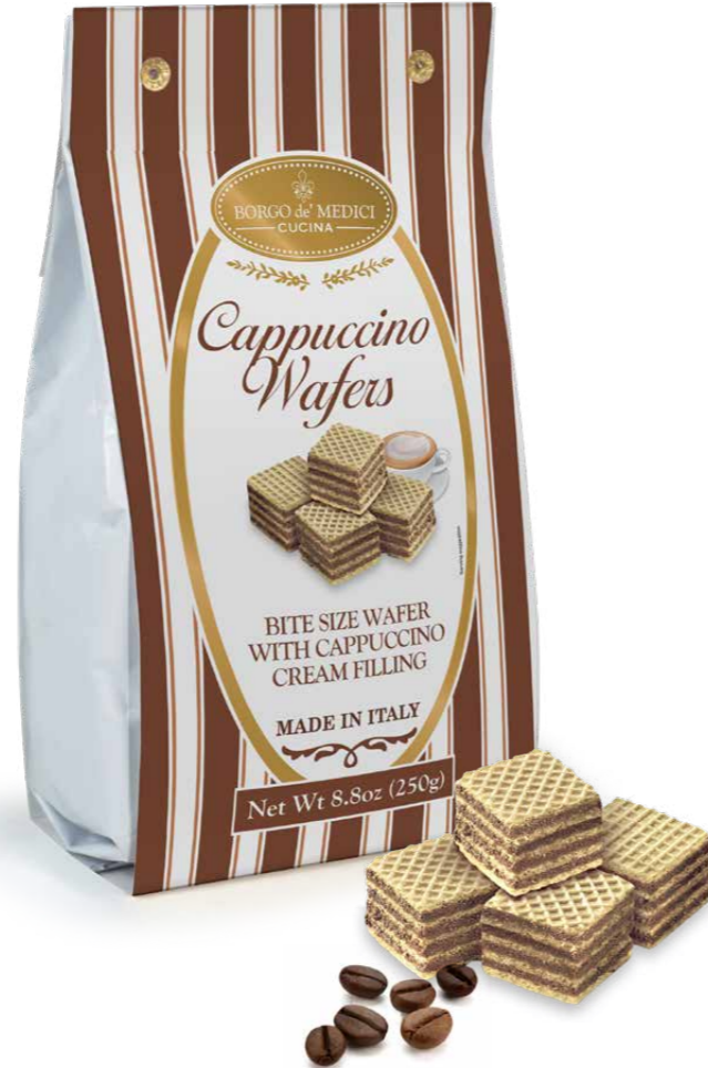
BH2228 CAPPUCCINO WAFERS 8.8 oz (250 g) 10 units/case