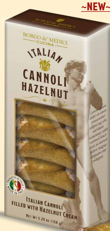
BH2410 CANNOLI HAZELNUT CREAM 150g 8 units/case