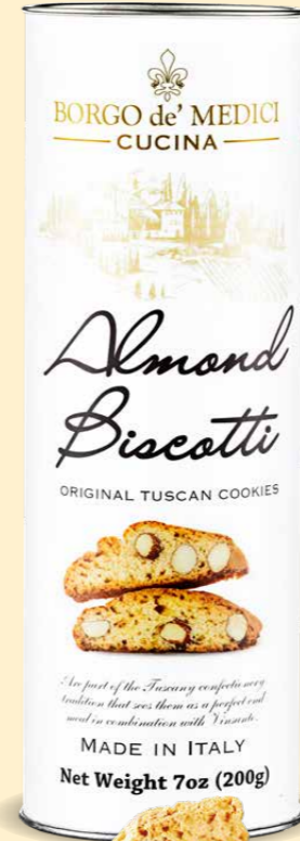
A050.451 ALMOND BISCOTTI IN TUBE 7 oz tube (200 g) 12 units/case