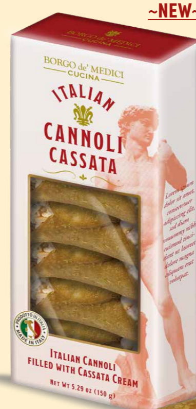
BH2406 CANNOLI CASSATA CREAM 150g 8 units/case