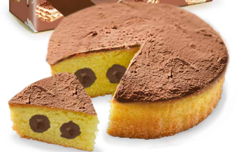
BH2422 TIRAMISÙ CREAM SOFT CAKE 14.10 oz (400 g) 12 units/case