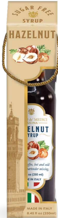
BH2119 HAZELNUT SUGAR FREE COFFEE SYRUP 8.45 fl oz (250 ml) 12 units/case