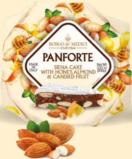
BH2219 PANFORTE CAKE WITH HONEY & ALMONDS in shelf tray 3.5 oz (100g) 10 units/case