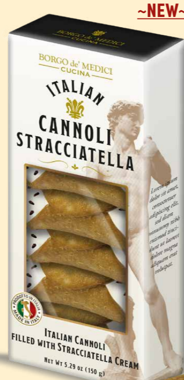
BH2408 CANNOLI STRACCIATELLA CREAM 150g 8 units/case