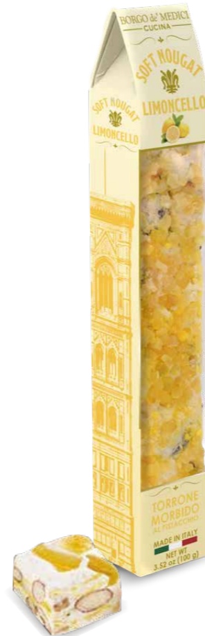
BH2127 SOFT NOUGAT BAR WITH LIMONCELLO 3.5 oz (100g) 12 units/case