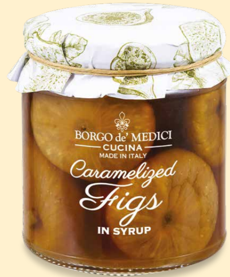
A108011ED CARAMELIZED FIGS IN SYRUP 11.28 oz (320 g) 6 units/case

Fresh fruit hand picked and cut, preserved in sweet wine.