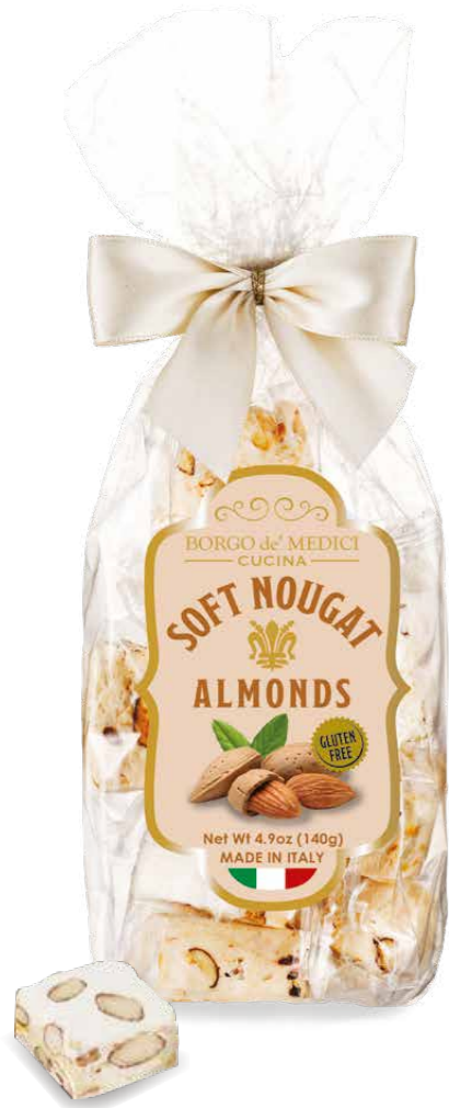
BH2130 ALMOND SOFT NOUGAT BITE IN BAG 4.9 oz (140 g) 8 units/case