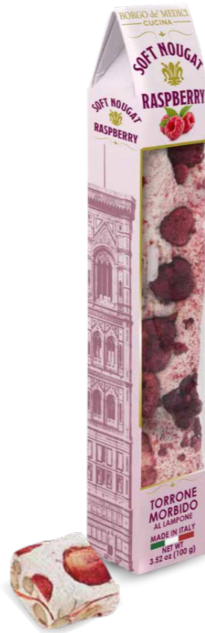
BH2126 SOFT NOUGAT BAR WITH RASPBERRY 3.5 oz (100g) 12 units/case