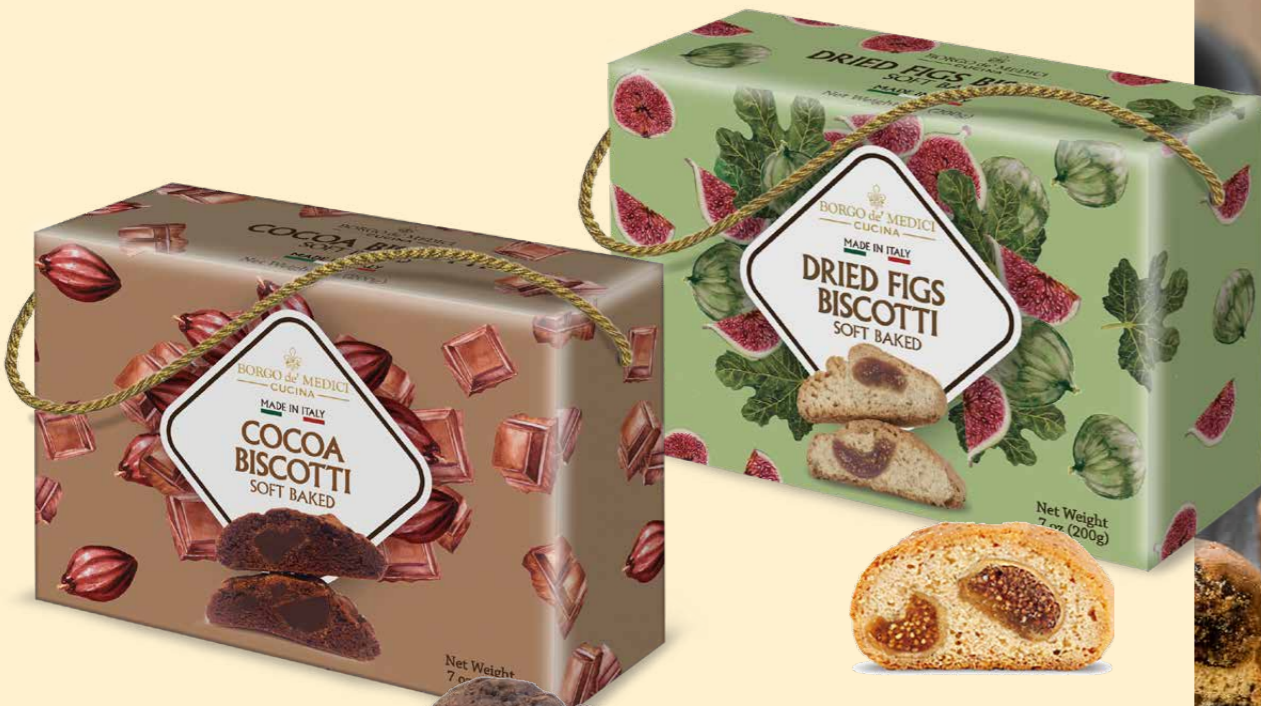
A050313 CHOCOLATE SOFT BAKED BISCOTTI IN BOX 7 oz (200 g) 12 units/case

The result sees the trademark crispness of Cantucci give way to a delicate softness that perfectly wraps itself around a sweet filling. To date, nobody has been able to recreate the mixture that makes these biscotti unique. These are the perfect gift for those looking for something unique and made with only the highest quality ingredients, or as the final course in any Holiday meal.