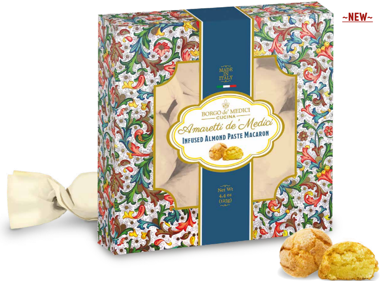
BH2418 INFUSED AMARETTI DE' MEDICI GLUTEN FREE 4.4 oz (125 g) 8 units/case