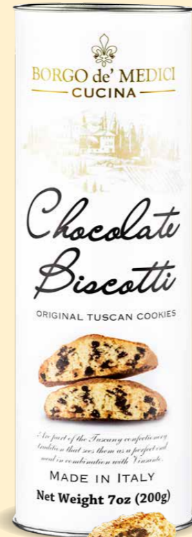
A050.452 CHOCOLATE BISCOTTI IN TUBE 7 oz tube (200 g) 12 units/case