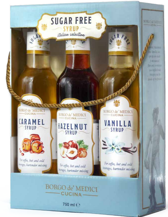
BH2235 TRIS SET SUGAR FREE COFFEE SYRUP 25.36 fl oz (750 ml) 6 units/case