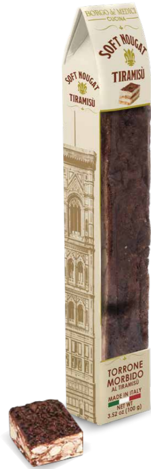
BH2124 SOFT NOUGAT BAR WITH TIRAMISÙ 3.5 oz (100g) 12 units/case