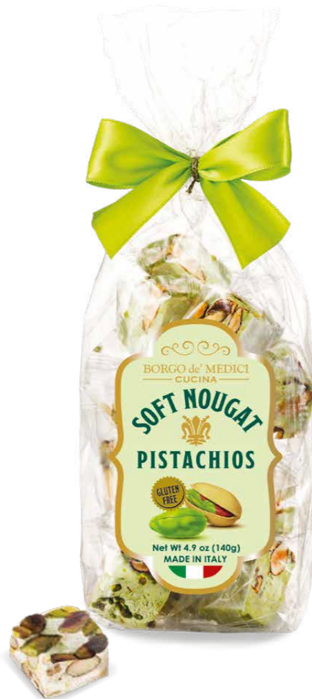
BH2131 PISTACHIO SOFT NOUGAT BITE IN BAG 4.9 oz (140 g) 8 units/case