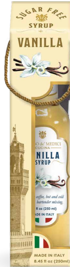
BH2118 VANILLA SUGAR FREE COFFEE SYRUP 8.45 fl oz (250 ml) 12 units/case