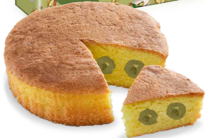
BH2423 PISTACHIO CREAM SOFT CAKE 14.10 oz (400 g) 12 units/case