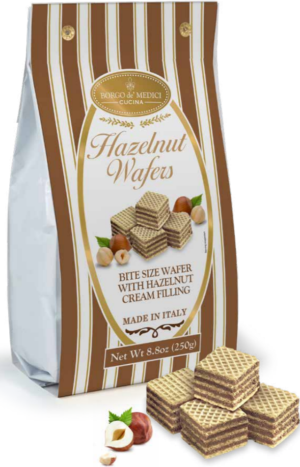
BH2227 HAZELNUT WAFERS 8.8 oz (250 g) 10 units/case