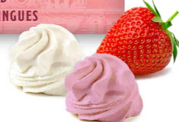
BH2236 STRAWBERRY & VANILLA FLAVORED MERINGUES 6.34 oz (180 g) 12 units/case