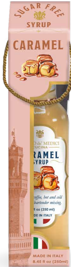
BH2120 CARMEL SUGAR FREE COFFEE SYRUP 8.45 fl oz (250 ml) 12 units/case