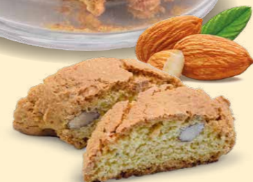
BH2110 ALMOND BISCOTTI IN JAR (individually wrapped inside) 7 oz (200g) 6 units/case