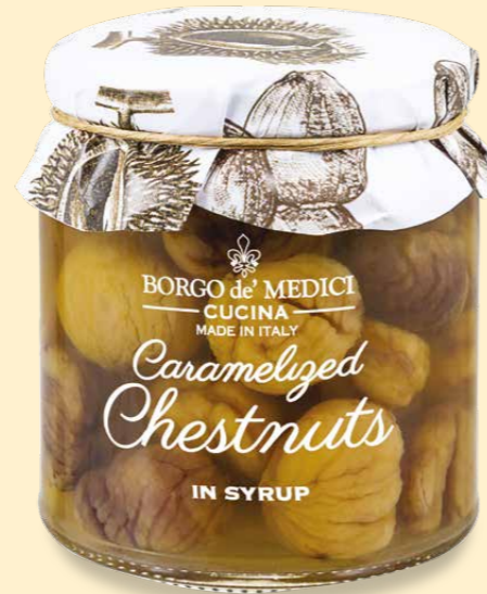
A108012ED CARAMELIZED CHESTNUTS IN SYRUP 12.34 oz (350 g) 6 units/case

Caramelized fig it's pretty much identical to our fig jam recipe (only with slightly less sugar), here they are barely touched, so that they do not break but remain perfectly whole. It's delicious with soft cheeses, which is how it's traditionally eaten, as part of a cheese platter.