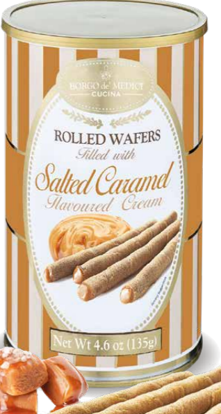
AS02248 SALTED CARAMEL ROLLED WAFERS 4.76 oz (135 g) 12 units/case