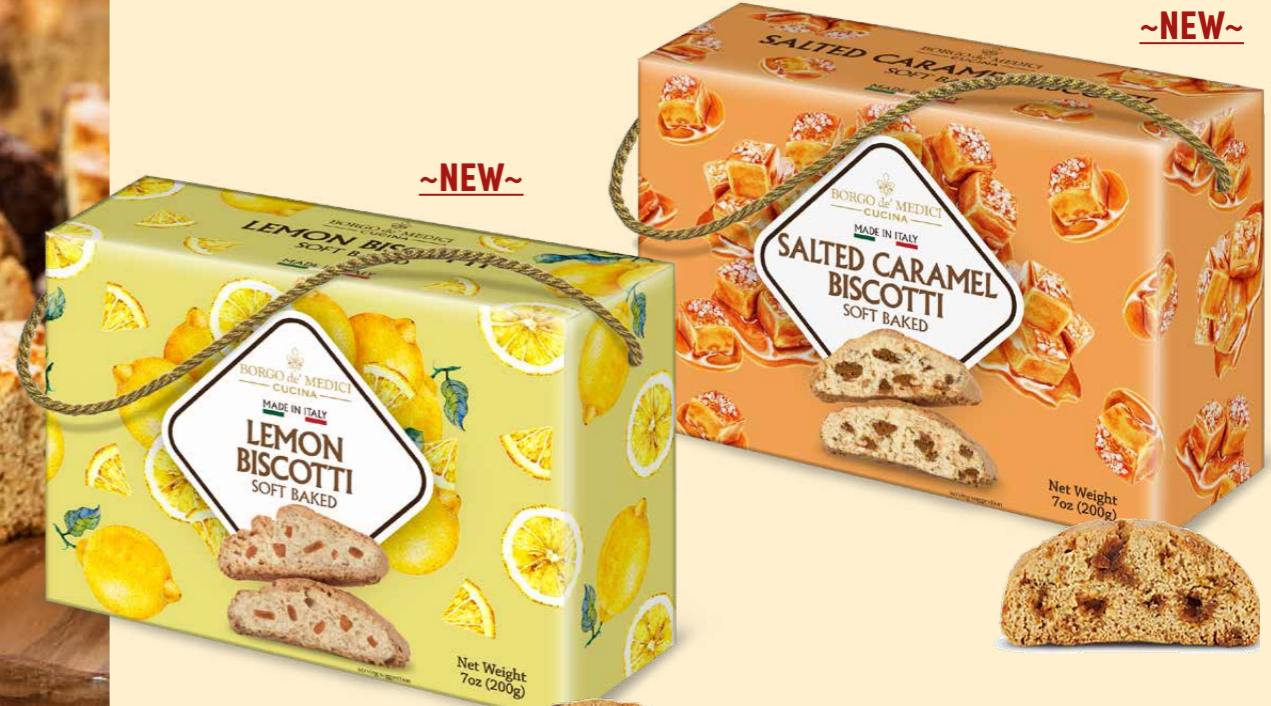
BH2416 LEMON CANDIED PEELS SOFT BISCOTTI 7 oz (200 g) 8 units/case