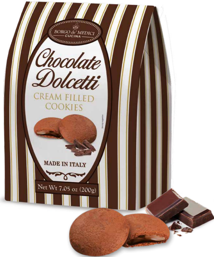
AS02249 CHOCOLATE DOLCETTI 7.0 oz (200 g) 12 units/case