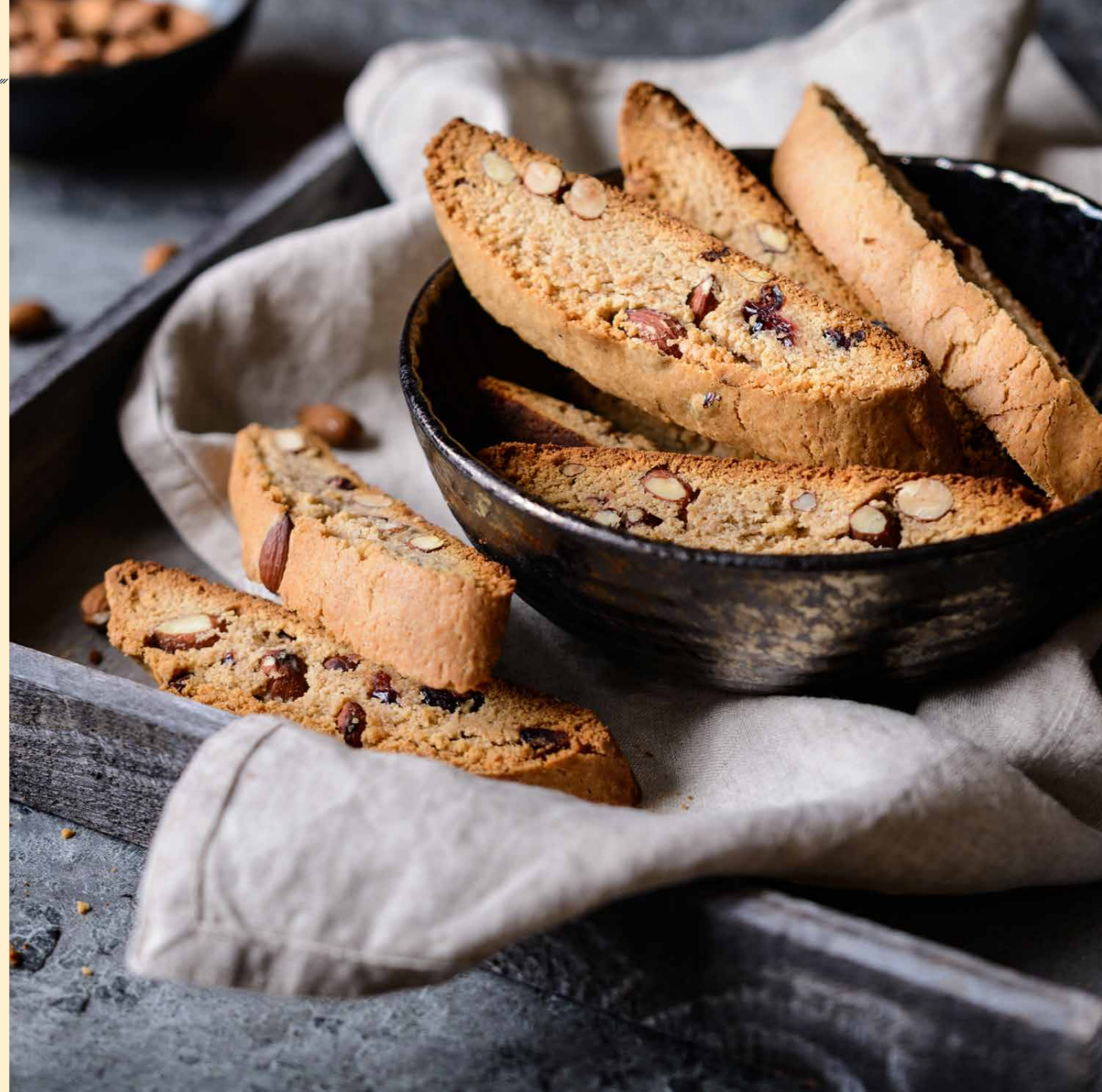
BH2421 LIMONCELLO BISCOTTI IN BOX 8.45 oz (240 g) 8 units/case