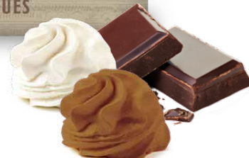
BH2238 CACAO & VANILLA FLAVORED MERINGUES 6.34 oz (180 g) 12 units/case