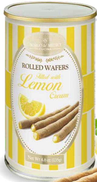
BH2323 LEMON ROLLED WAFERS 4.76 oz (135 g) 12 unit/case