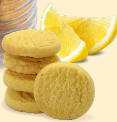
BH2112 LIMONCELLO FLAVORED FROLLINI - TEA COOKIES IN JAR (individually wrapped inside) 7 oz (200g) 6 units/case