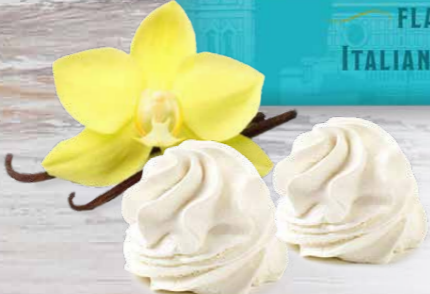
BH2432 VANILLA FLAVORED MERINGUES 6.34 oz (180 g) 12 units/case