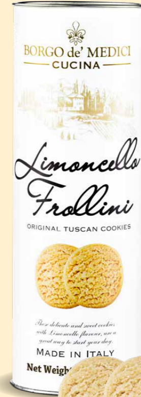
AS01664 LIMONCELLO ITALIAN SHORTBREADS IN TUBE 6.35 oz tube (180 g) 12 units/case