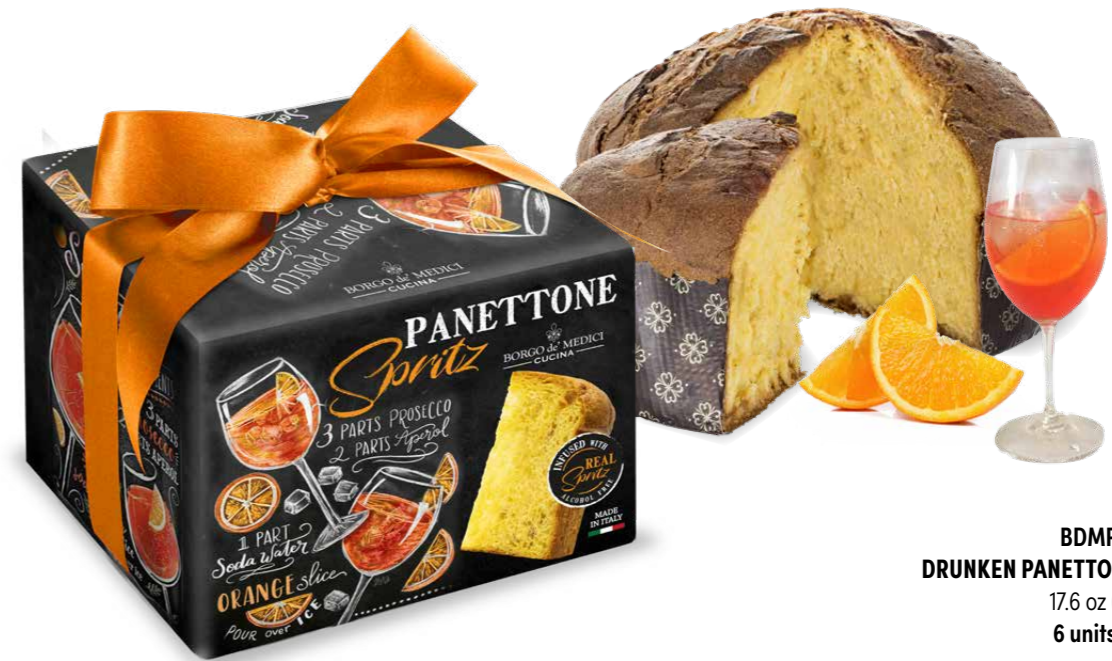
BDMP2106 DRUNKEN PANETTONE SPRITZ INFUSED 17.6 oz (500g) 6 units/case