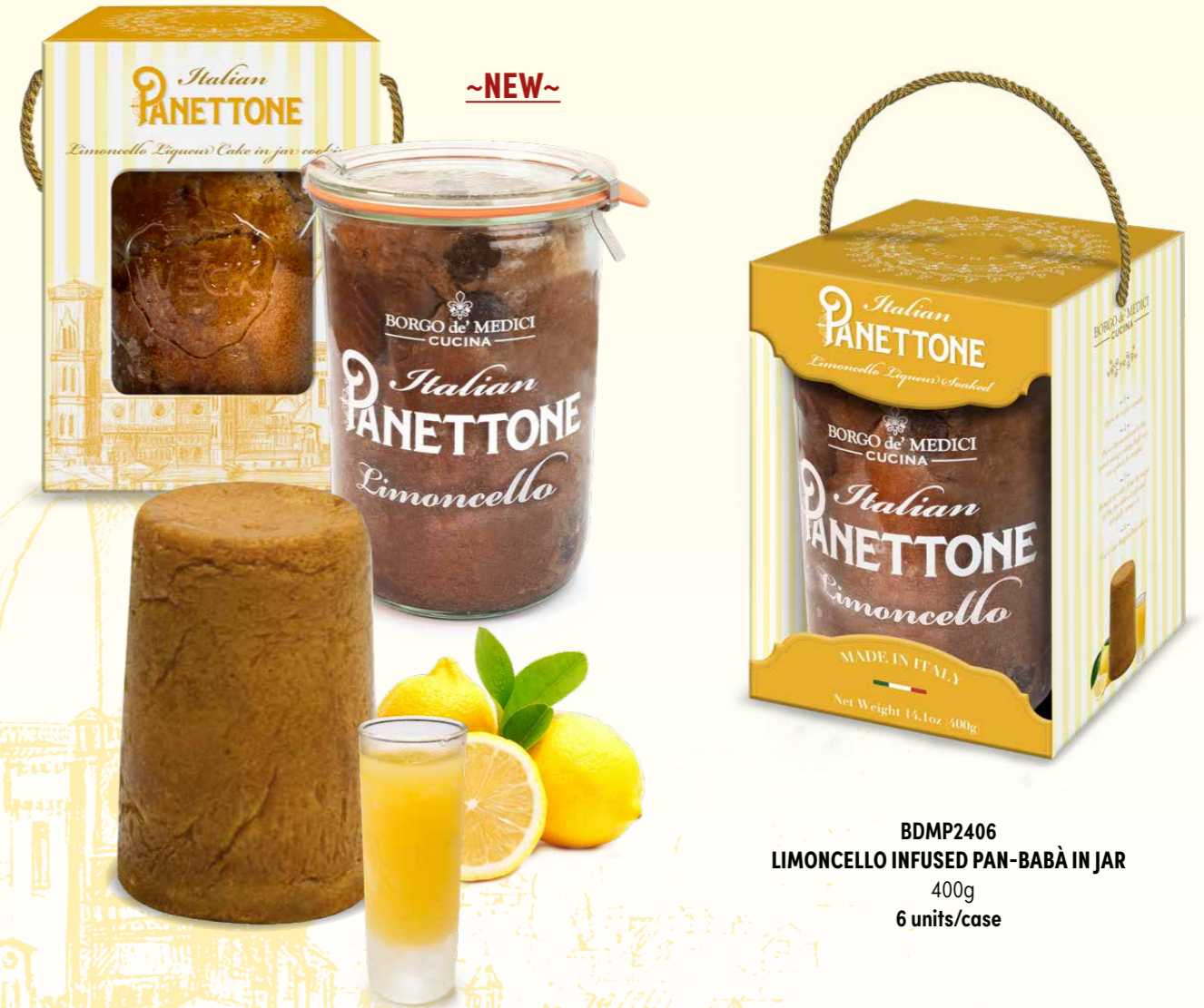
BDMP2406 LIMONCELLO INFUSED PAN-BABÀ IN JAR 400g 6 units/case