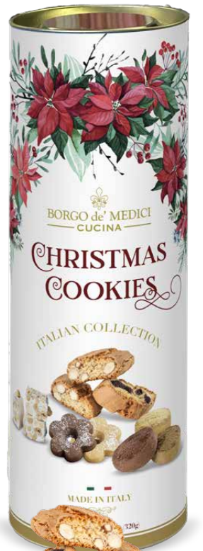
BDMP2320 ASSORTED COOKIES 300g 12 unit/case