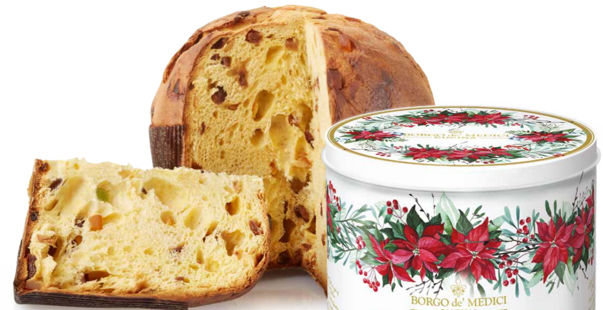
BDMP2303 CLASSIC PANETTONE IN TIN 750g 6 unit/case