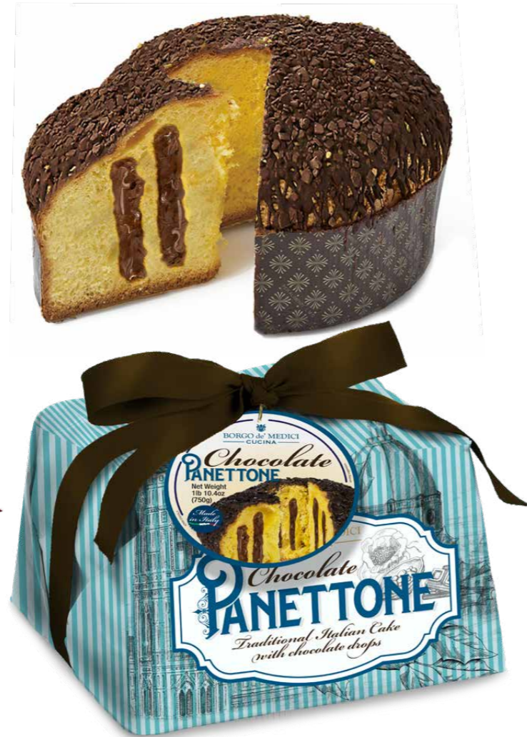
BDMP2202 PANETTONE CHOCOLATE CAKE Filled with Chocolate cream 1 lb 10.4oz (750g) 6 units/case