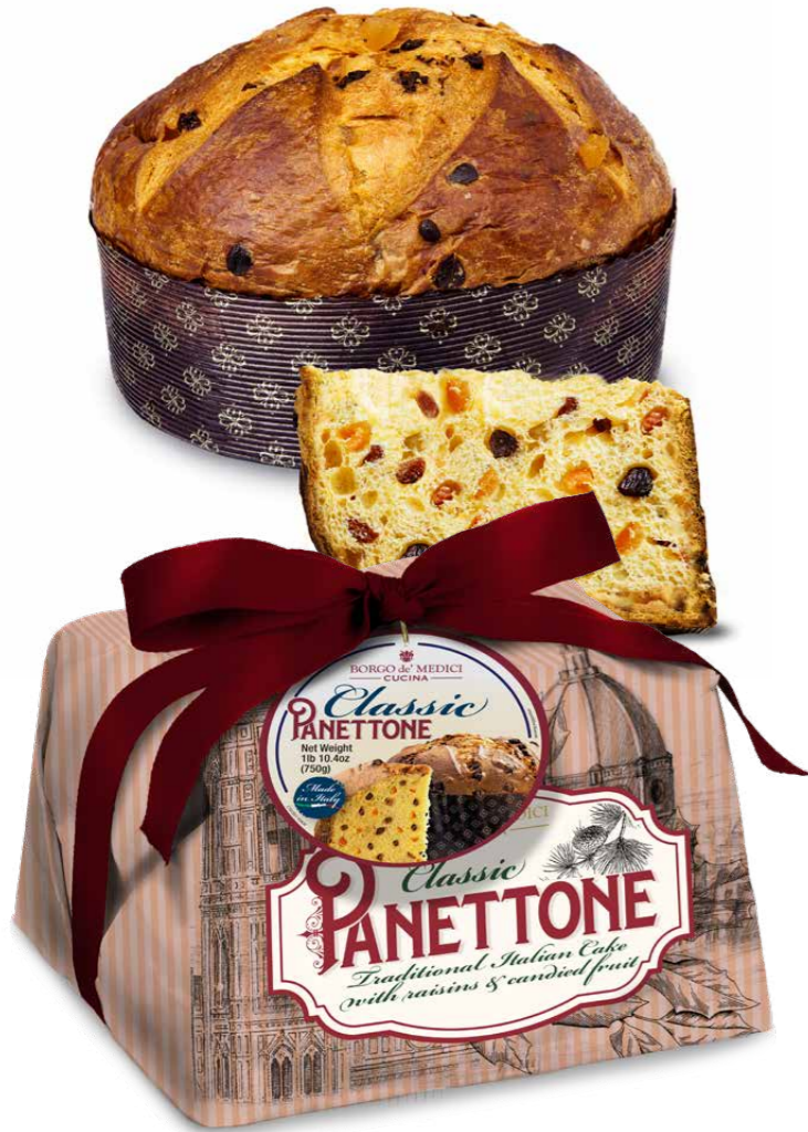
BDMP2201 PANETTONE CLASSIC FRUIT CAKE with Sultana Raisins and candied fruit 1 lb 10.4oz (750g) 6 units/case

Panettone of this line is prepared using only fresh milk, fresh butter and natural vanilla.