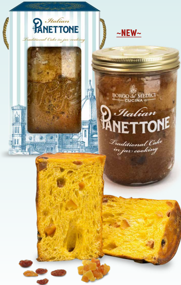
BDMP2405 CLASSIC PANETTONE MILANO IN JAR 400g 6 units/case