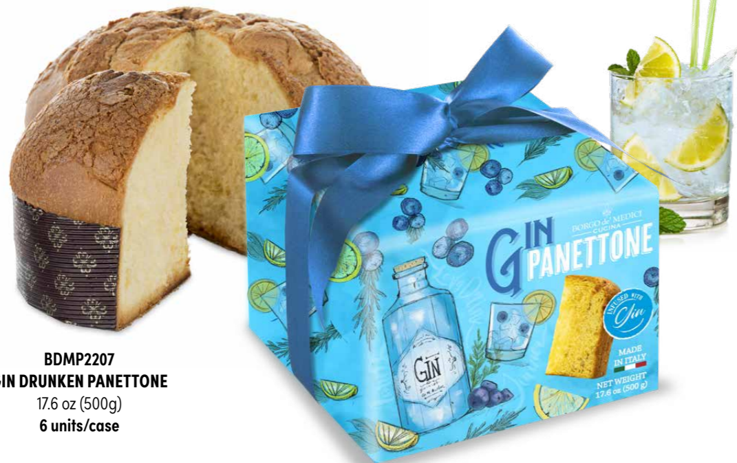
BDMP2207 GIN DRUNKEN PANETTONE 17.6 oz (500g) 6 units/case