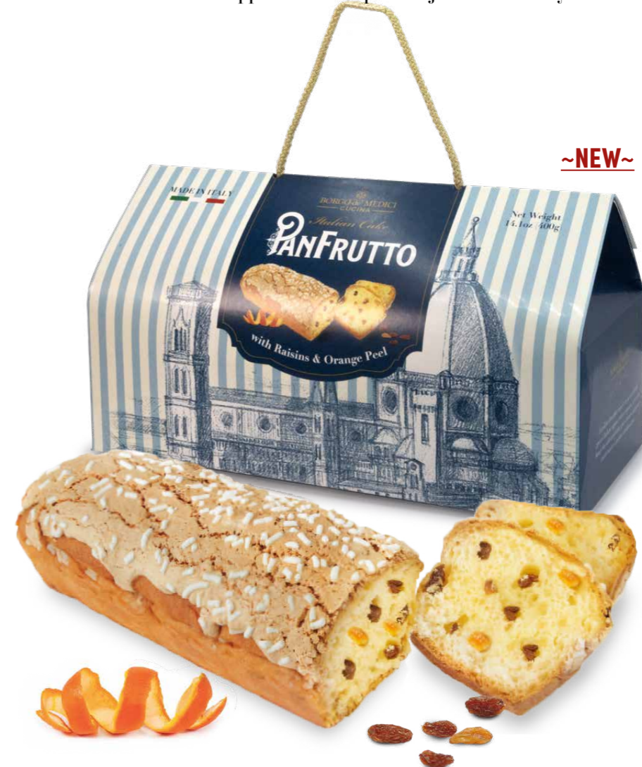
BH2437 PANFRUTTO LEAVENED CAKE (LOAF CAKE) 14.10 oz (400 g) 6 units/case

The leavened dessert with fine semi-candied fruit, excellent to pair with the typical Italian cappuccino or espresso, jams and honey