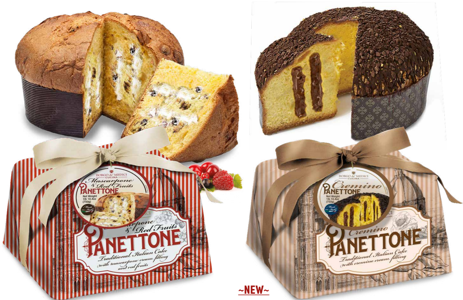
BDMP2302 MASCARPONE & RED FRUITS Filled with Mascarpone cream and red fruits 1 lb 10.4oz (750g) 6 unit/case

Panettone of this line is prepared using only fresh milk, fresh butter and natural vanilla.