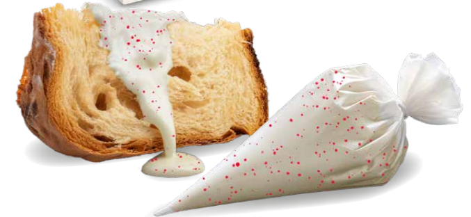
BDMP2401 PAN DE' MEDICI CLASSIC FLORENTINE CAKE 1 lb 10.4oz (620g) 6 units/case