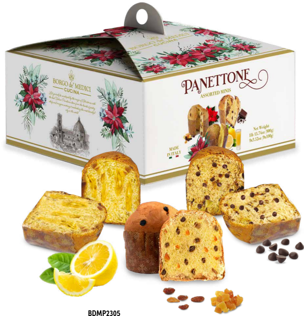
BDMP2305 ASSORTMENT OF 9 MINIS PANETTONE 9x100g 4 unit/case