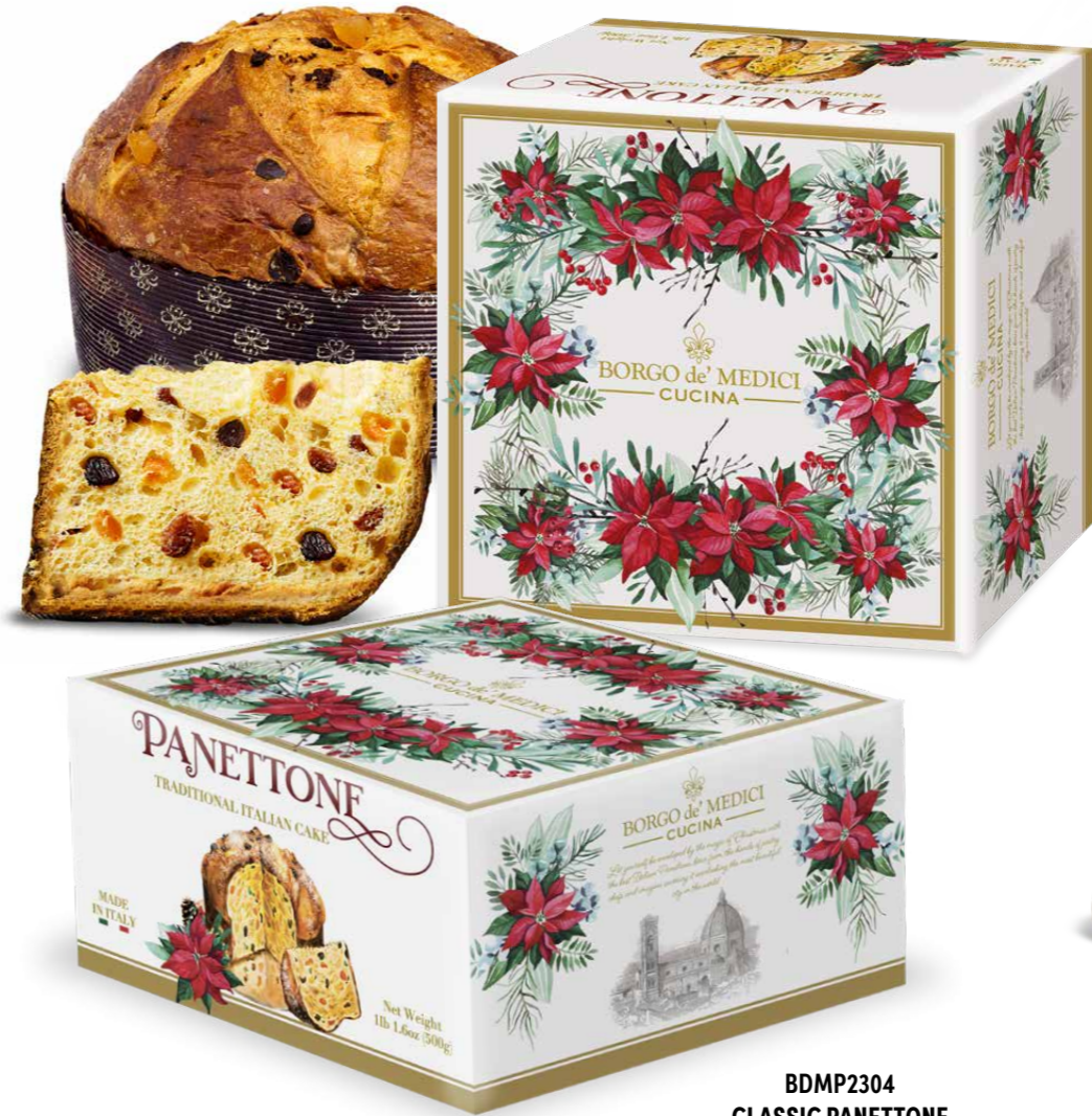
BDMP2304 CLASSIC PANETTONE 500g 12 unit/case