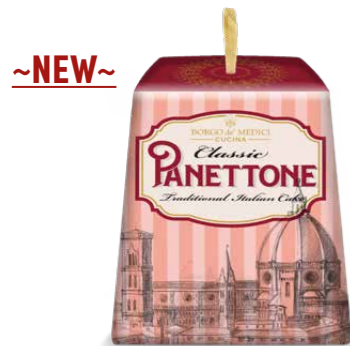
BDMP2408 CLASSIC FLORENTINE PANETTONE 750g 6 units/case