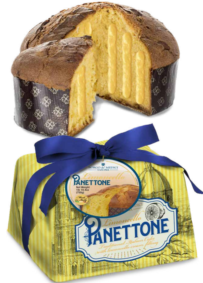
BDMP2204 PANETTONE LIMONCELLO CREAM FILLED CAKE 1 lb 10.4oz (750g) 6 units/case