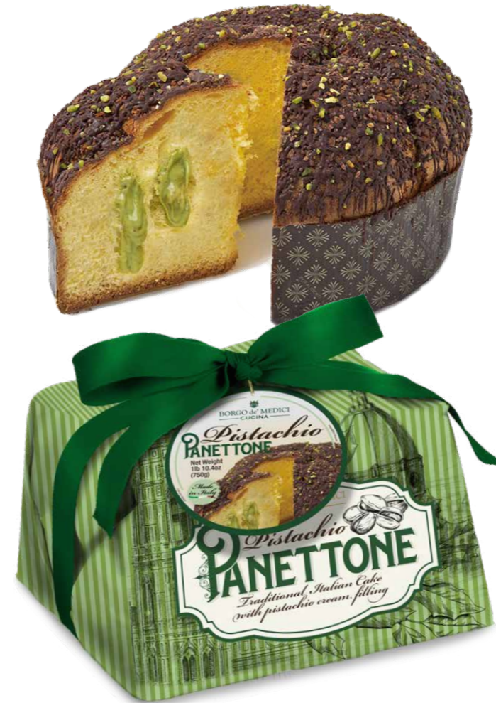
BDMP2203 PANETTONE PISTACHIO CREAM FILLED CAKE 1 lb 10.4oz (750g) 6 units/case