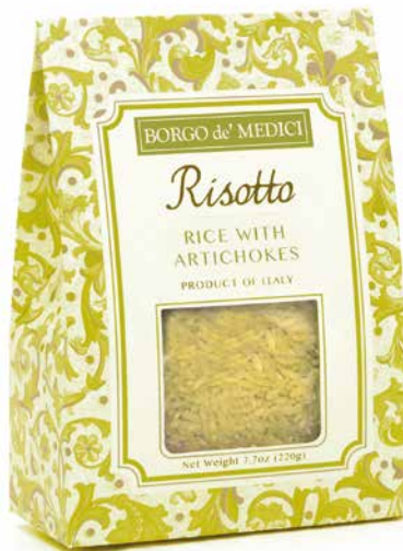
A033046 ARTICHOKE RISOTTO 7.7 oz (220g) 8 units/case