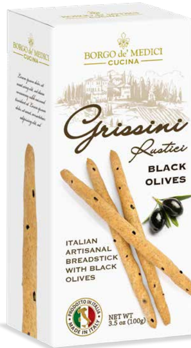
AS02806 GRISSINI RUSTICI ARTISANAL BREADSTICKS WITH OLIVES 3.52 oz (100g) 12 units/case