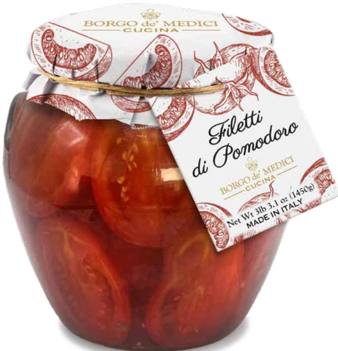
BD2514 TOMATO FILLETS 3lb 3.1 oz (1450 g) 4 units/case