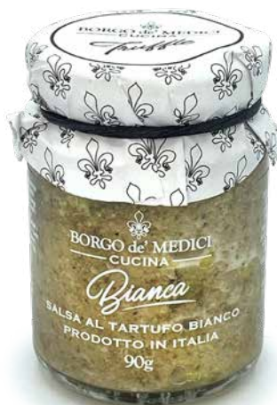
AS01649 BIANCA white Truffle Sauce 3.17 oz (90g) 12 units/case