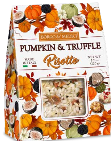
BF2105 PUMPKIN & TRUFFLE RISOTTO 7.76 oz (220 g) 12 units/case