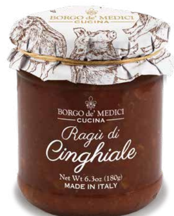
BD2527 RAGÙ DI CINGHIALE 6.3 oz (180g) 12 units/case