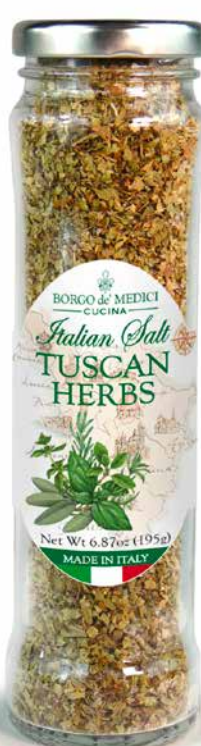
AS02851 TUSCAN HERBS Salt with Herbs Mix 6.87 oz (195g) 12 units/case