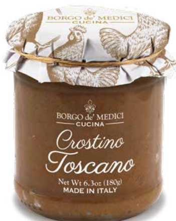
BD2523 CROSTINO TOSCANO 6.3 oz (180g) 12 units/case