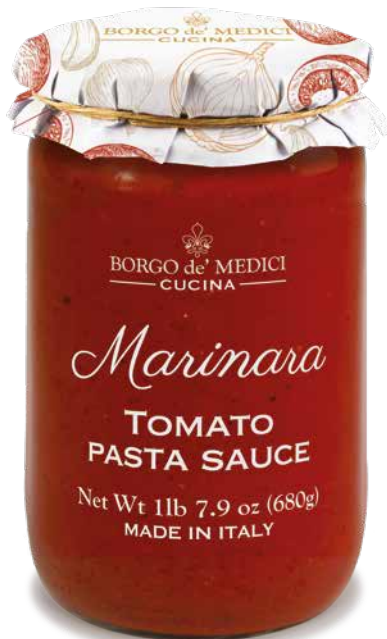
AS02869 MARINARA TOMATO Pasta Sauce 1lb 8oz (680g) 6 units/case