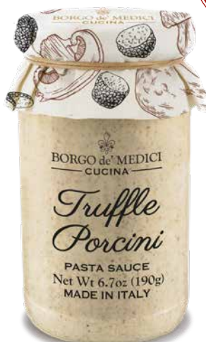
AS01648 TRUFFLE PORCINI CREAM Pasta Sauce 6.7 oz (190g) 6 units/case