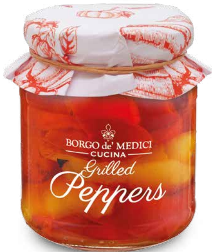
A024047 GRILLED PEPPERS IN EVO 9.8 oz (280g) 6 units/case

A trio of Mediterranean flavors ready to tantalize the palate: the sweetness of Grilled Peppers, the earthy delicacy of Grilled Artichokes, and the aromatic vibrancy of Marinated Garlic. A taste of sunshine for all your culinary creations.