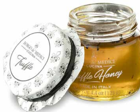
AS01652 BLACK TRUFFLE HONEY 4.4 oz (125g) 12 units/case