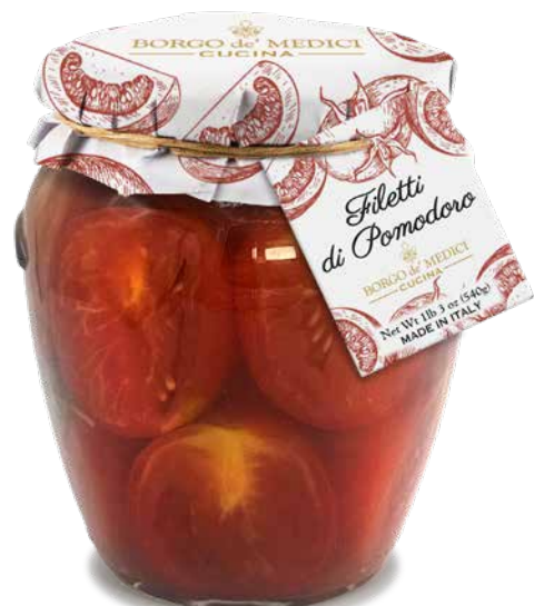
BD2515 TOMATO FILLETS 1lb 3 oz (540 g) 6 units/case