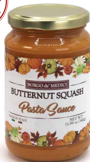
BH2490 BUTTERNUT SQUASH PASTA SAUCE 12 oz (340 g) 6 units/case