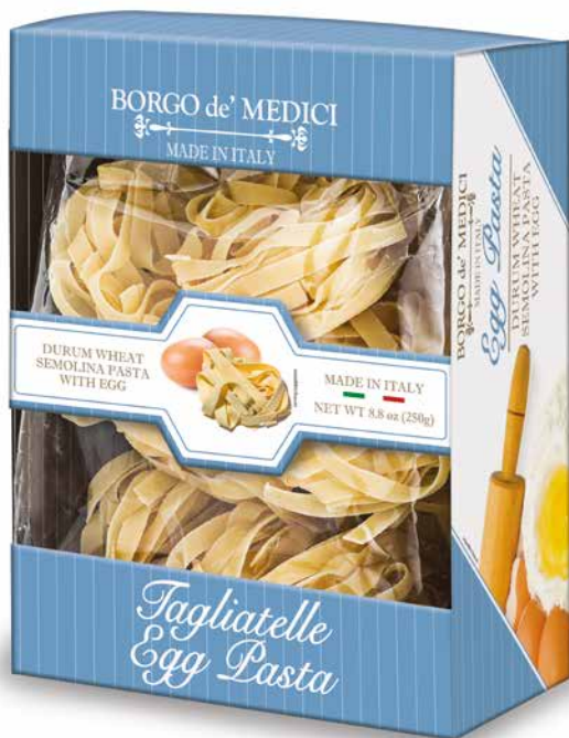
A040006 TAGLIATELLE (medium width) Nests Egg Pasta in Tray 8.8 oz (250g) 8 units/case