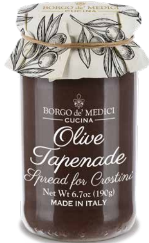
FC022008 BLACK OLIVE TAPENADE 6.7 oz (190g) 6 units/case