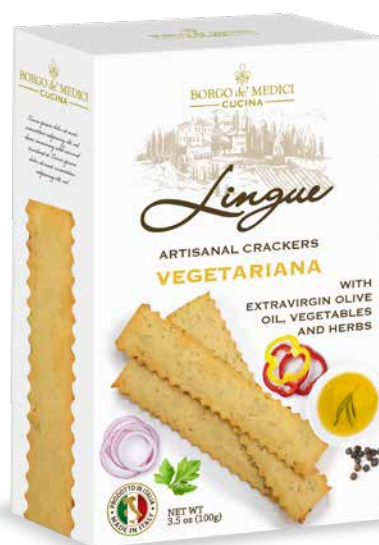
AS02809 LINGUE VEGETARIANE TUSCAN FLATBREAD WITH VEGETABLES 3.52 oz (100g) 12 units/case