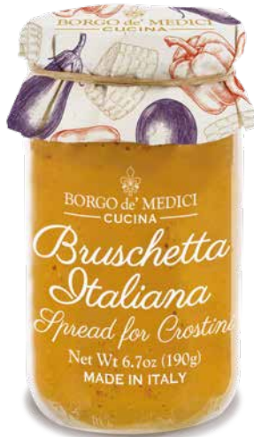
A023018 BRUSCHETTA ITALIANA Ricotta Cheese & Bell Peppers 6.7 oz (190g) 6 units/case