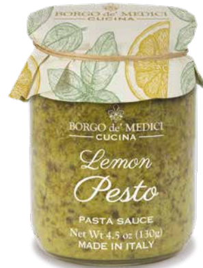
BD2517 LEMON PESTO 4.5 oz (130g) 6 units/case