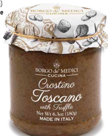
BD2524 CROSTINO TOSCANO AL TARTUFO 6.3 oz (180g) 12 units/case