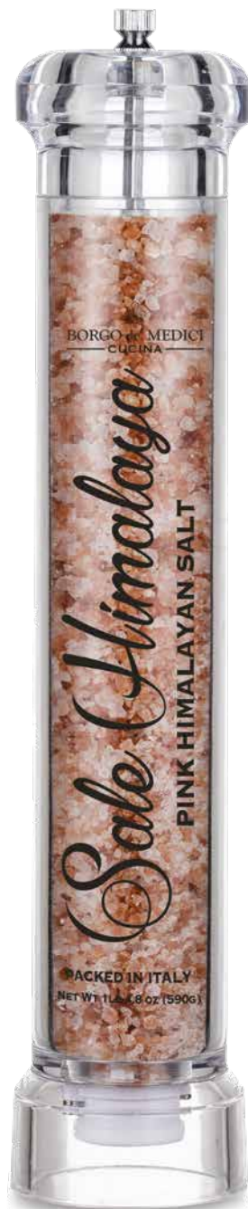
A059107ED HIMALAYAN SALT GIANT GRINDER 1lb 4.81 oz (590 g) 6 units/case

A touch of flavor from the heart of Italy and the peaks of the Himalayas. Pure, high-quality Italian salt and precious pink Himalayan salt, presented in practical giant grinders. An elegant and functional way to enhance all your culinary creations with a pinch of authenticity and well-being.