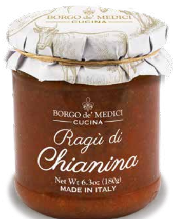
BD2526 RAGÙ DI CHIANINA 6.3 oz (180g) 12 units/case