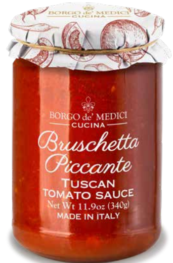
BD2513 SPICY TUSCAN TOMATO BRUSCHETTA 10.5 oz (300 g) 6 units/case