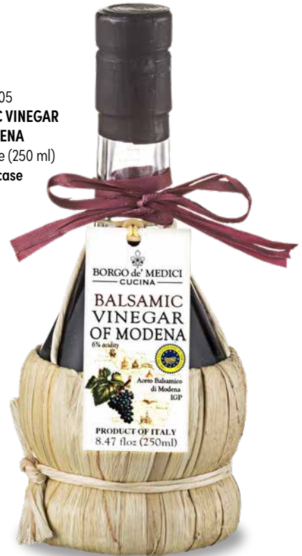
A029005 IGP BALSAMIC VINEGAR OF MODENA 8.47 fl oz bottle (250 ml) 6 units/case