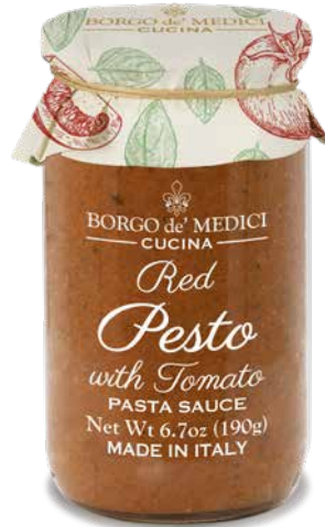
A017019 RED PESTO 6.7 oz (190g) 6 units/case