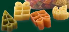
A042051 ORGANIC CHRISTMAS SHAPES 5 COLORS PASTA 1lb 1.6 oz bag (500 g) 12 units/case