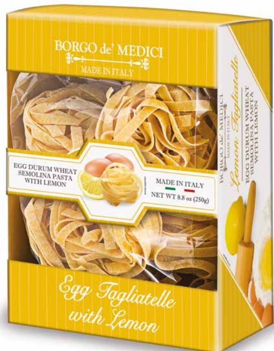
AS01639 LEMON FLAVORED TAGLIATELLE NESTS 8.8 oz (250g) 8 units/case