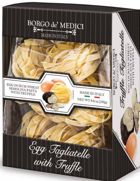
AS01640 TRUFFLE FLAVORED TAGLIATELLE NESTS 8.8 oz (250g) 8 units/case