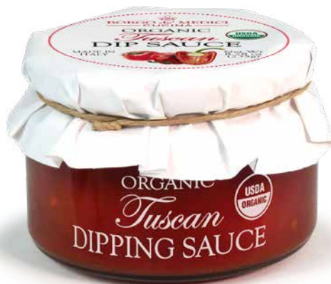
BD2507 RED HOT TUSCAN DIPPING SAUCE 8.2 oz (235g) 6 units/case

Two Italian dipping sauces for your snacks: spicy tomato for an intense flavor and fresh basil for a Mediterranean touch. Perfect for chips and appetizers.