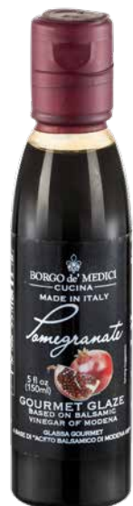
AS01663 POMEGRANATE GLAZE 5.1 fl oz (150 ml) 12 units/case