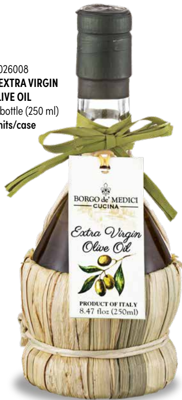
A026008 ITALIAN EXTRA VIRGIN OLIVE OIL 8.47 fl oz bottle (250 ml) 6 units/case