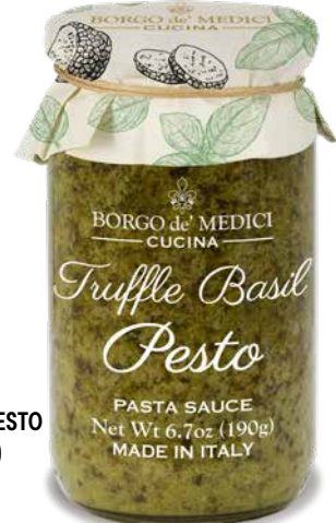
AS01646 TRUFFLE BASIL PESTO 6.35 oz (180g) 6 units/case