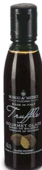
A029031 TRUFFLE BALSAMIC GLAZE 5.1 fl oz (150 ml) 12 units/case

Made with balsamic vinegar of Modena PGI*