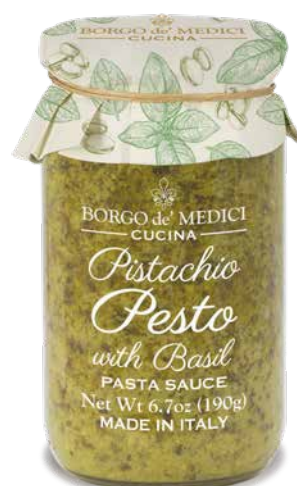
BD2519 PISTACHIO PESTO 6.7 oz (190g) 6 units/case