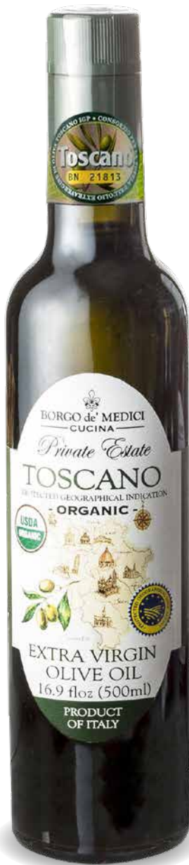
A01660 TUSCAN PGI* PRIVATE ESTATE EXTRA VIRGIN OLIVE OIL 16.9 fl oz (500ml) 6 units/case

100% Italian Extra Virgin Olive Oil - First Cold Pressing