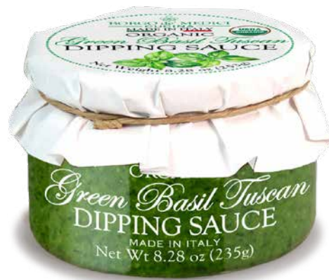
BD2538 GREEN BASIL TUSCAN DIPPING SAUCE 8.2 oz (235g) 6 units/case