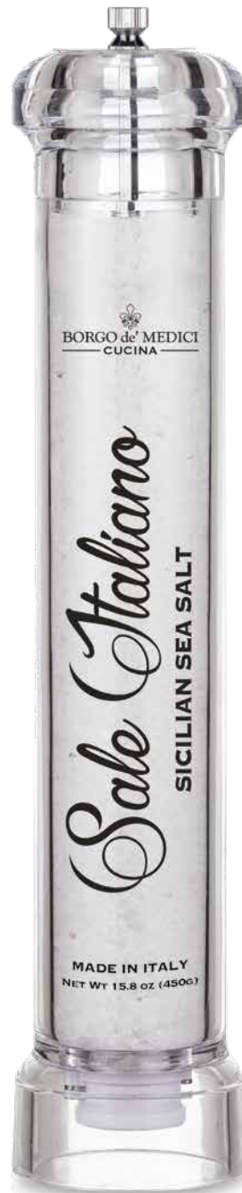
A059105ED SEA SALT GIANT GRINDER 15.8 oz (450 g) 6 units/case