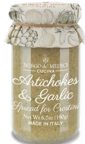
FC022007 ARTICHOKES & GARLIC Spread 6.7 oz (190g) 6 units/case