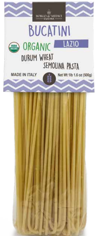
BD2535 ORGANIC BUCATINI 1lb 1.6 oz (500g) 12 units/case