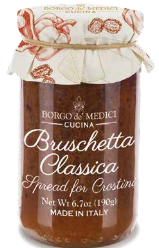
A023012 BRUSCHETTA CLASSICA Sundried Tomato Garlic & Basil 6.7 oz (190g) 6 units/case