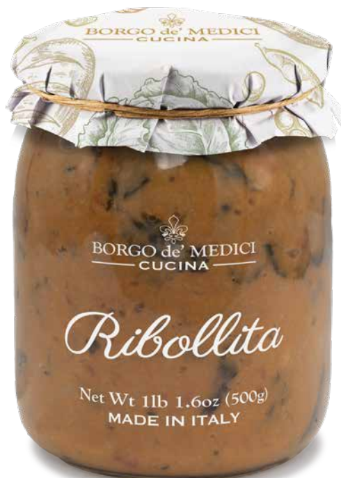
BD2531 RIBOLLITA 1lb 1.6 oz (500g) 6 units/case

Savor the rustic goodness of Ribollita, with its rich and enveloping flavors, and the tasty simplicity of Pappa al Pomodoro (tomato and bread soup), a timeless classic.