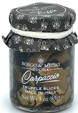
AS01655 CARPACCIO Black Truffle slices 3 oz (85g) 12 units/case