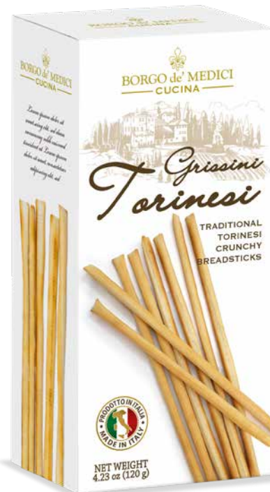
AS02803 GRISSINI CROCCANTI TORINESI BREADSTICKS 4.2 oz (120g) 12 units/case