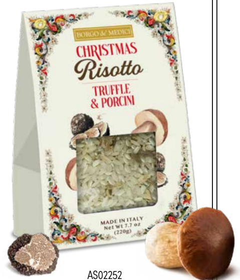
AS02252 CHRISTMAS RISOTTO WITH TRUFFLE & MUSHROOMS 7.76 oz (220 g) 12 units/case