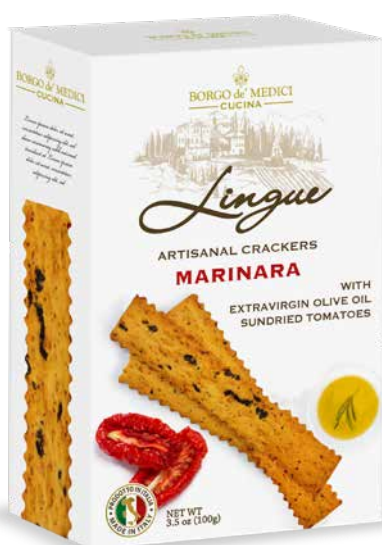
AS02808 LINGUE MARINARA TUSCAN FLATBREAD WITH TOMATO, EVO & OREGANO 3.52 oz (100g) 12 units/case

No palm oil - Made with natural sordough - No artificial coloring and presevatives