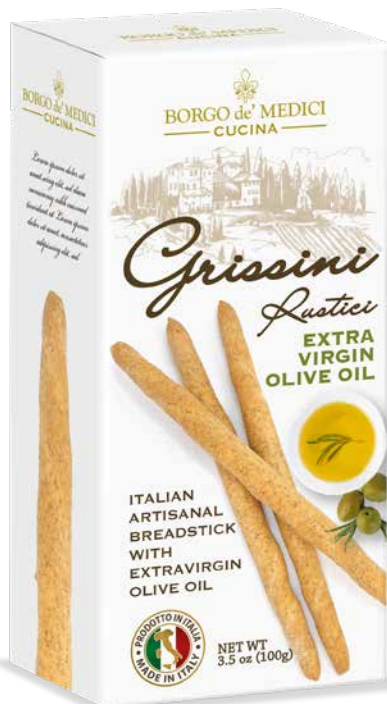
AS02804 GRISSINI RUSTICI ARTISANAL BREADSTICKS WITH EVO 3.52 oz (100g) 12 units/case