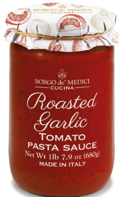
AS02872 ROASTED GARLIC TOMATO Pasta Sauce 1lb 8oz (680g) 6 units/case