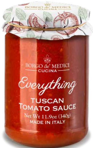
BD2511 POMAROLA EVERYTHING TUSCAN SAUCE 11.9 oz (340 g) 6 units/case