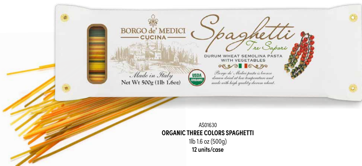
AS01630 ORGANIC THREE COLORS SPAGHETTI 1lb 1.6 oz (500g) 12 units/case

Packed by hand - Bronze drawn - Natural colors - Dried at low temperature