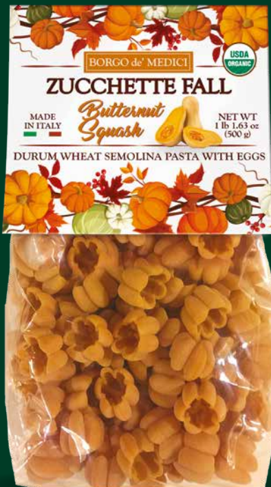
BF2103 ZUCCHETTE - BUTTERNUT SQUASH ORGANIC FLAVORED PASTA 1lb 1.63 oz (500 g) 12 units/case