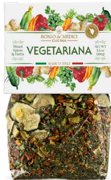
AS01659 VEGETARIANA MIXED SPICES 3.52 oz (100g) 12 units/case