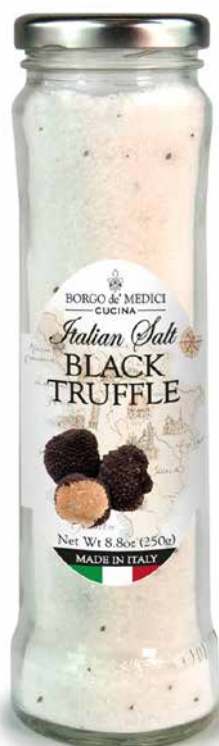
AS02852 BLACK TRUFFLE Sea Salt 8.8 oz (250g) 12 units/case

Fine coarse italian salt mixed with luxury ingredients & special Tuscany style mixed spices