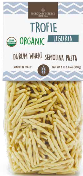
AS02798 ORGANIC TROFIE 1lb 1.6 oz (500g) 12 units/case