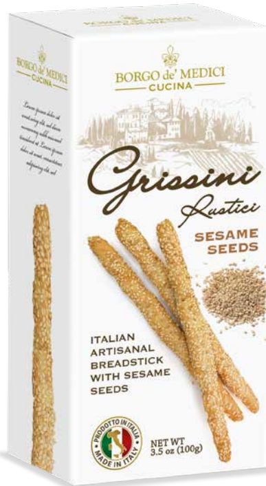
AS02805 GRISSINI RUSTICI ARTISANAL BREADSTICKS WITH SESAME SEEDS 3.52 oz (100g) 12 units/case