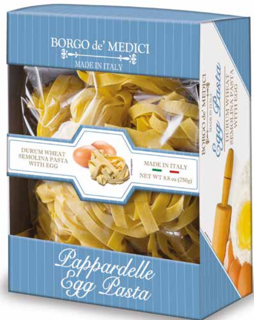
A040007 PAPPARDELLE (large width) Nests Egg Pasta in Tray 8.8 oz (250g) 8 units/case