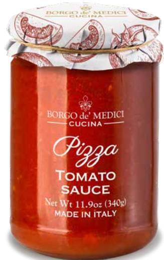
BD2512 TUSCAN TOMATO PIZZA SAUCE 10.5 oz (300 g) 6 units/case