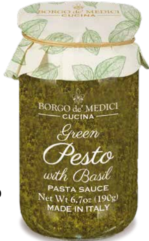
A017005 GREEN PESTO 6.7 oz (190g) 6 units/case