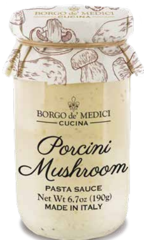
AS01647 PORCINI MUSHROOM Pasta Sauce 6.7 oz (190g) 6 units/case