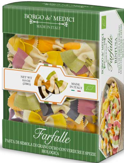
AS01632 ORGANIC MIXED COLORS BOW TIE PASTA 8.8 oz (250g) 12 units/case

A rainbow of cheer on your table! Cute butterfly pasta with colorful stripes, perfect for bringing a smile to every dish. Presented in practical and lively cases, they are an original and fun idea for young and old alike.