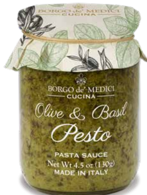
BD2518 OLIVE & BASIL PESTO 4.5 oz (130g) 6 units/case