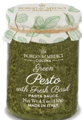
A017013 GOURMET PESTO 4.5 oz (130g) 6 units/case