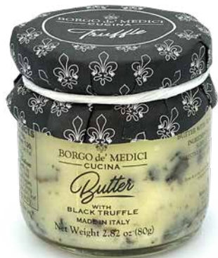
AS01654 TRUFFLE BUTTER 2.65 oz (75g) 12 units/case