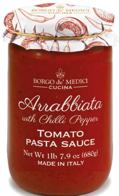
AS02871 ARRABBIATA TOMATO Pasta Sauce 1lb 8oz (680g) 6 units/case