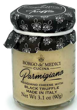
AS01769 PARMIGIANO CHEESE Cream with Truffle 3.2 oz (90g) 6 units/case