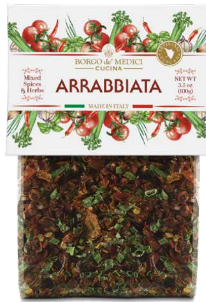
A030102ED ARRABBIATA MIXED SPICES 3.52 oz (100g) 12 units/case