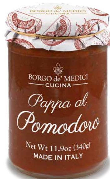
BD2532 PAPPA AL POMODORO 11.9 oz (340g) 6 units/case