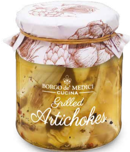
A024049 GRILLED ARTICHOKEs IN EVO 9.8 oz (280g) 6 units/case