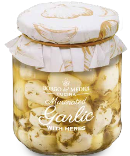
BD2506 MARINATED GARLIC WITH HERBS 9.8 oz (280g) 6 units/case