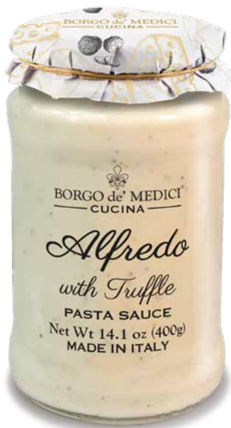
AS02876 ALFREDO TRUFFLE CHEESE Pasta Sauce 14.1 oz (400g) 6 units/case