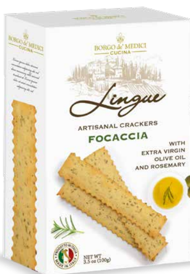
AS02807 LINGUE ALL'OLIO TUSCAN FLATBREAD WITH EVO 3.52 oz (100g) 12 units/case