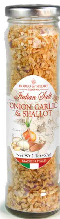
AS02853 TUSCAN COUNTRY SPICE MIX Salt with Herbs Mix 6.87 oz (195g) 12 units/case