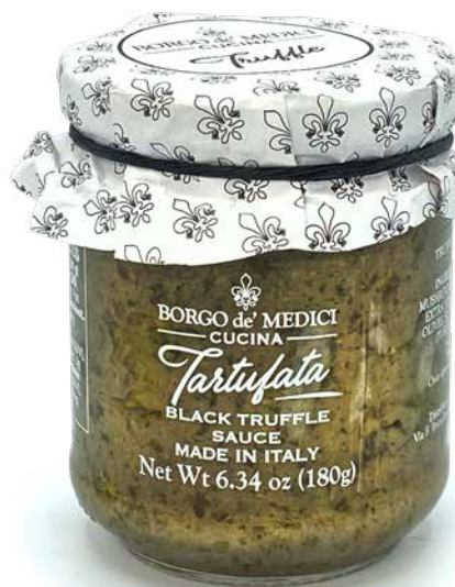
A021001 TARTUFATA Black Truffle Sauce 6.3 oz (180g) 12 units/case