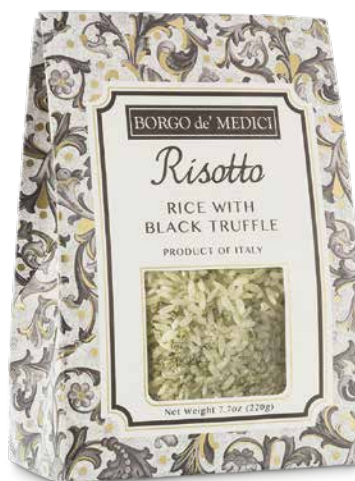
A033037 TRUFFLE RISOTTO 7.7 oz (220g) 8 units/case