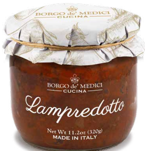
BD2529 LAMPREDOTTO 1lb 1.6 oz (500g) 6 units/case