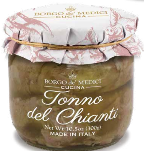
BD2528 TONNO DEL CHIANTI 10.5 oz (300g) 6 units/case