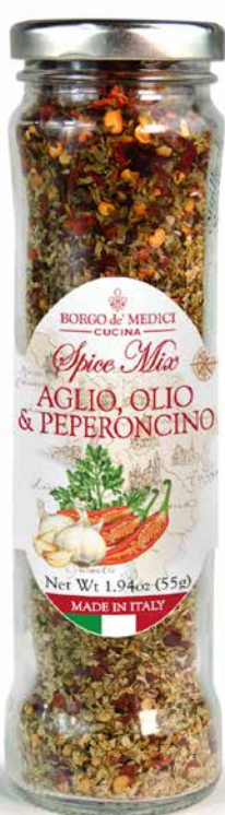
AS02854 AGLIO OLIO E PEPPERONCINO Spice Mix 1.94 oz (55g) 12 units/case