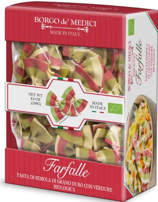
AS01633 ORGANIC ITALIAN FLAG BOW TIE PASTA 8.8 oz (250g) 12 units/case