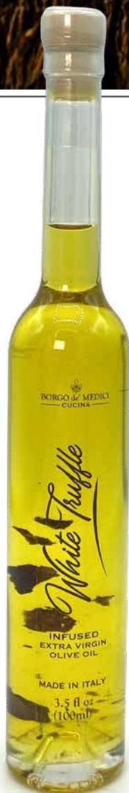
AS01653 EVO OIL WHITE TRUFFLE Extravirgin olive oil 3.38 fl oz 100 ml (90g) 12 units/case

From Tuscany woods to your tables. The aspiration is to offer an unforgettable emotion to our customers, by combining our precious fruits of the earth with Highest quality Ingredients to offer a Real Truffle experience. A collection of Truffle products to share on their own or with your favorite dishes.