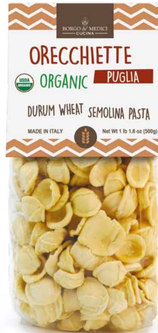
AS02796 ORGANIC ORECCHIETTE 1lb 1.6 oz (500g) 12 units/case