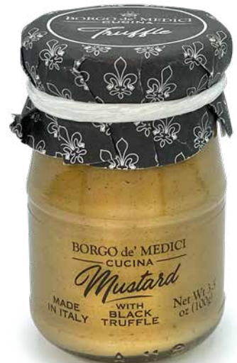
AS01651 MUSTARD with Black Truffle 3.5 oz (100g) 6 units/case