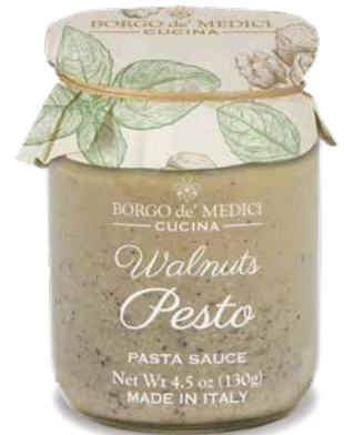
BD2516 WALNUTS PESTO 4.5 oz (130g) 6 units/case