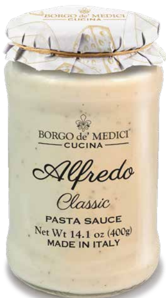
AS02875 ALFREDO CLASSIC CHEESE Pasta Sauce 14.1 oz (400g) 6 units/case

Four delicious variations for a touch of sophisticated taste.