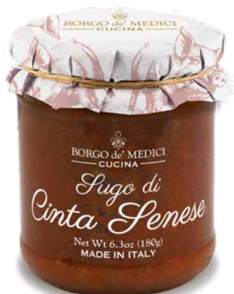
BD2525 SUGO DI CINTA SENESE 6.3 oz (180g) 12 units/case

A dive into the robust flavors of Tuscany to dress your pasta. Savor the prized Cinta Senese Sauce, the rich Chianina Ragù, the wild Boar Ragù, the intense Lampredotto, the flavorful Peposo, and the original Tonno del Chianti (Chianti "Tuna"). Tuscan specialties that transform every dish into an authentic and passionate taste experience.