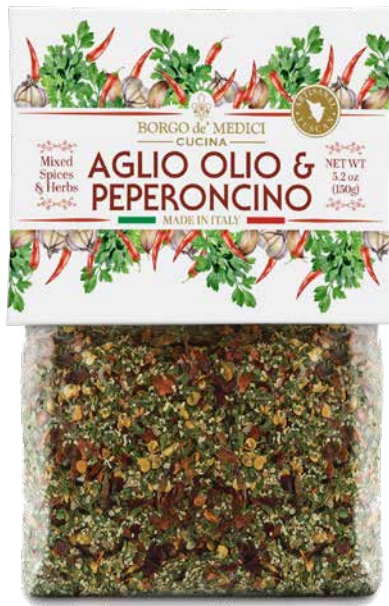
A030101ED AGLIO, OLIO & PEPERONCINO MIXED SPICES 5.29 oz (150g) 12 units/case

Mixes of aromatic spices designed to enhance your pasta and salads. From Mediterranean notes to more vibrant fragrances, a simple way to add a pinch of Italian authenticity to your culinary creations.