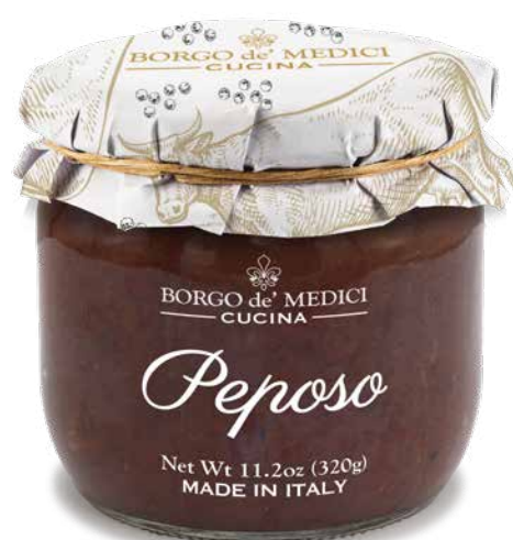
BD2530 PEPOSO 1lb 1.6 oz (500g) 6 units/case