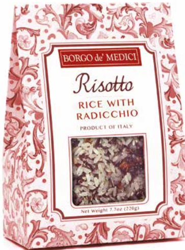
A033047 RADICCHIO RISOTTO 7.7 oz (220g) 8 units/case

A taste of authentic Italian cuisine, ready in minutes. Four ready-to-cook risottos with unmistakable flavors: the slightly bitter red radicchio, the delicate artichoke, the elegance of truffle, and the sunny saffron. A simple and quick way to bring the richness of Italian flavors to your table.