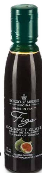
A029030 FIG BALSAMIC GLAZE 5.1 fl oz (150 ml) 12 units/case