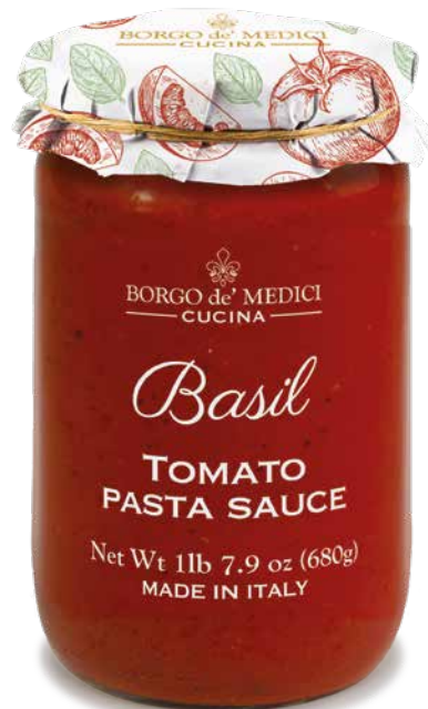
AS02870 TOMATO & BASIL Pasta Sauce 1lb 8oz (680g) 6 units/case