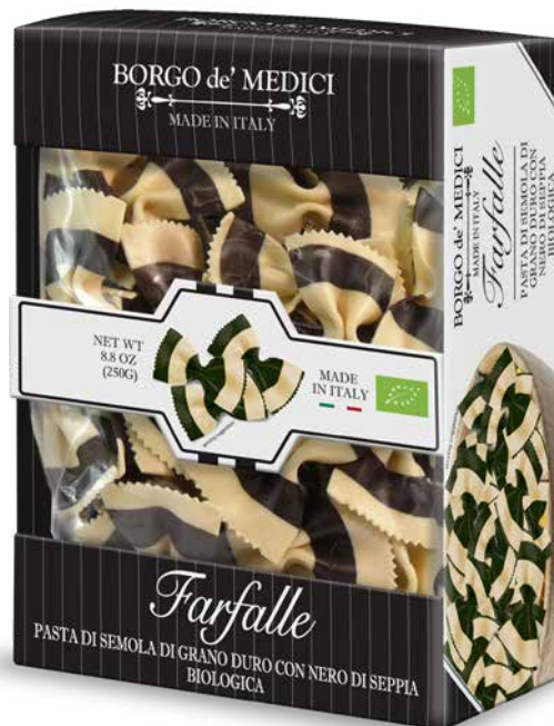
AS01634 ORGANIC BLACK AND WHITE BOW TIE PASTA 8.8 oz (250g) 12 units/case