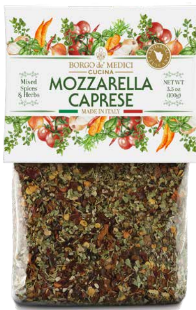
A030104ED MOZZARELLA CAPRESE MIXED SPICES 3.52 oz (100g) 12 units/case