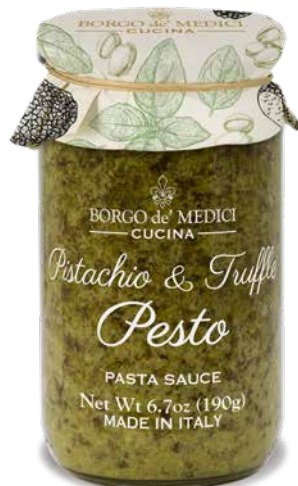
BD2520 PISTACHIO & TRUFFLE PESTO 6.7 oz (190g) 6 units/case