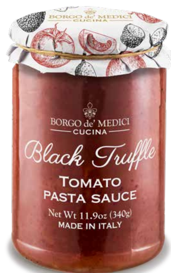
AS01644 BLACK TRUFFLE & TOMATO Pasta Sauce 12 oz (340g) 6 units/case