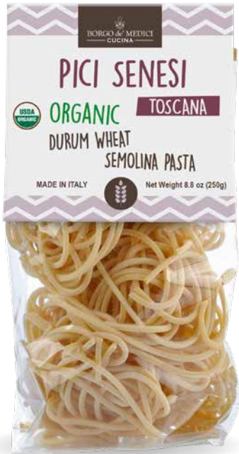
AS02800 ORGANIC PICI SENESI Durum Wheat Pasta 8.8 oz (250g) 12 units/case