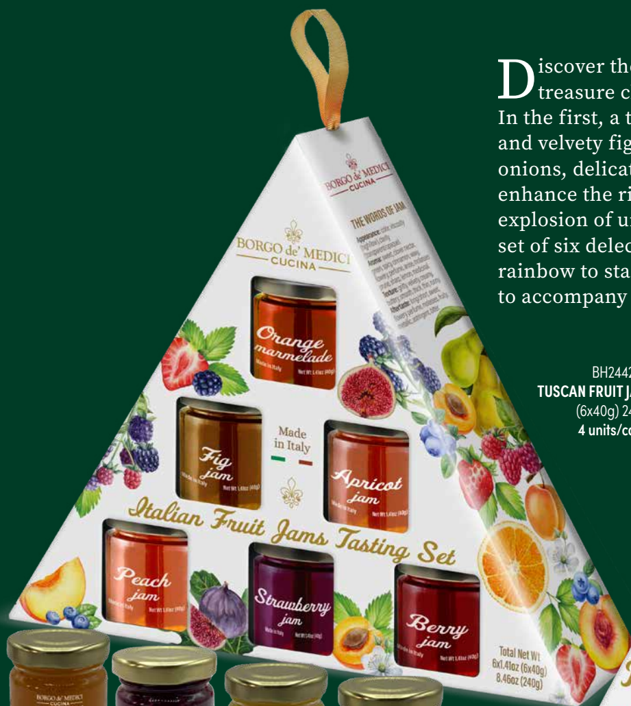
BH2442 TUSCAN FRUIT JAMS TREE (6x40g) 240g 4 units/case