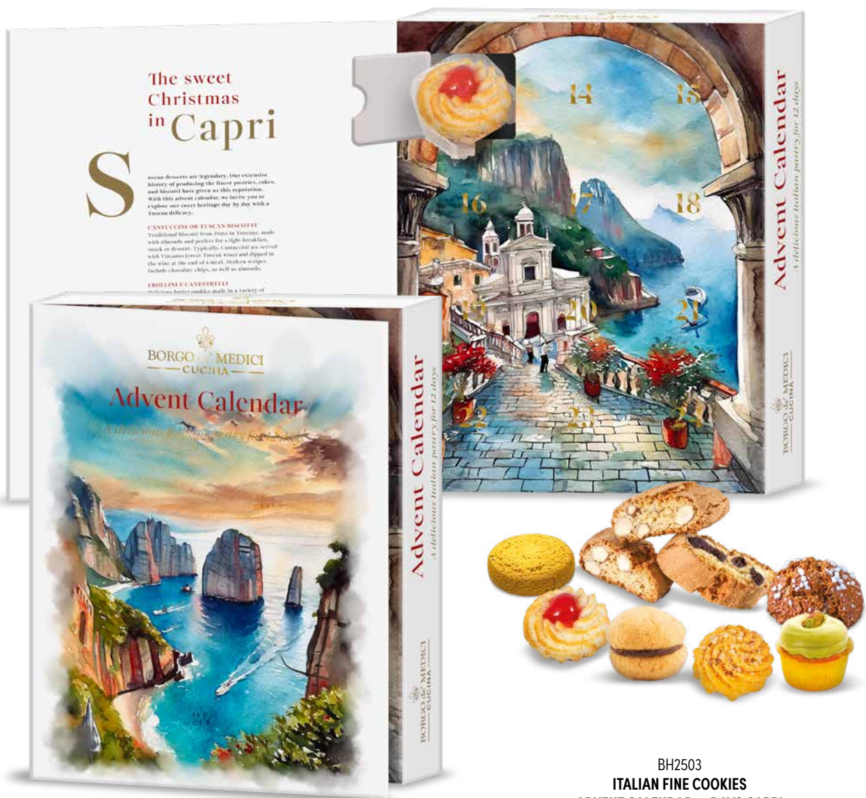
BH2503 ITALIAN FINE COOKIES ADVENT CALENDAR 12 DAYS CAPRI Assortment italian cookies 6.7 oz (192g) 9 units/case