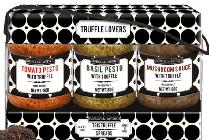
AG00308 TRIO TRUFFLE DIPPING CREAM AND PESTOS

Contains: White Truffle Extra Virgin Olive Oil 5.9 fl oz Black Truffle Extra Virgin Olive Oil 5.9 fl oz 11.83 fl oz (175x2 ml) 6 units/case