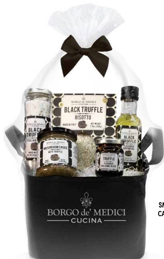
BH2447 SMALL TRUFFLE CANVAS BASKET 1 unit/case