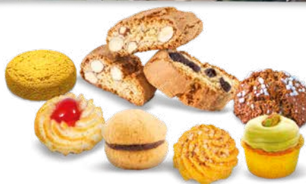
BH2501 ITALIAN FINE COOKIES ADVENT CALENDAR 12 DAYS ROME Assortment Italian cookies 6.7 oz (192g) 9 units/case