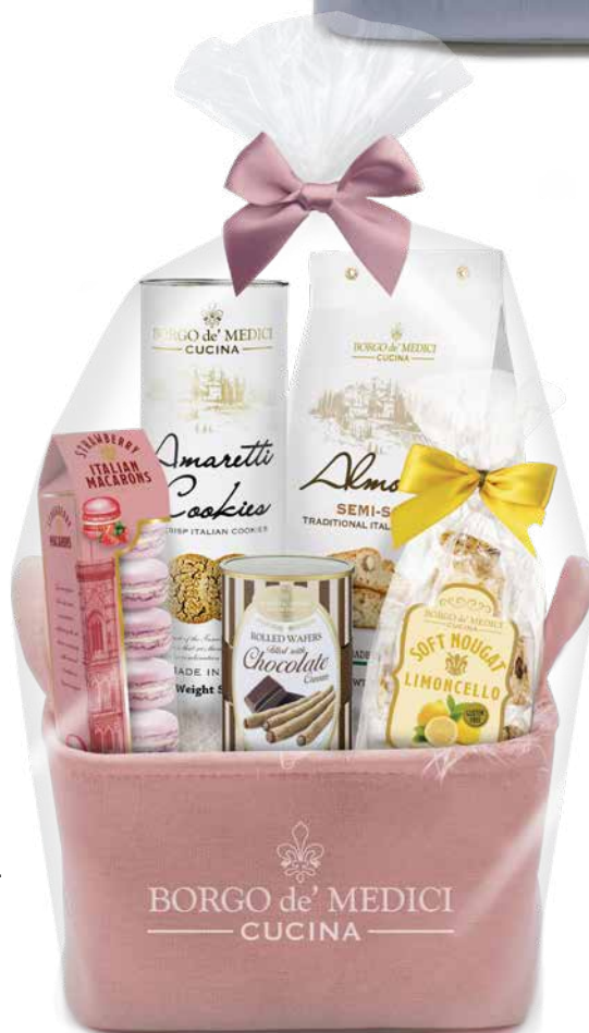
BH2309 MEDIUM SWEET CANVAS BASKET 1 unit/case