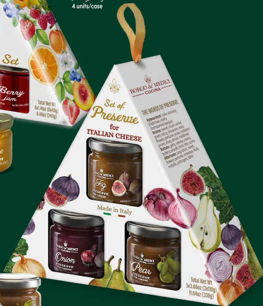
BH2443 TUSCAN JAMS FOR CHEESE (3x110g) 330g 4 units/case