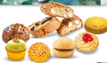
BH2502 ITALIAN FINE COOKIES ADVENT CALENDAR 12 DAYS VENICE 6.7 oz (192g) 9 units/case