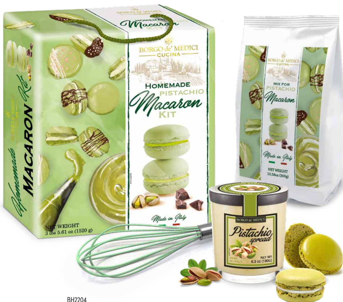
BH2204 HOMEMADE MACARONS KIT PISTACHIO

The dough is first shaped into a log and baked. After the baked dough log cools, you slice it on the diagonal and bake the cookies a second time until they are crisp. The recipe we give you is so easy and you can make lots of different flavors of biscotti so that there is something everyone will like.