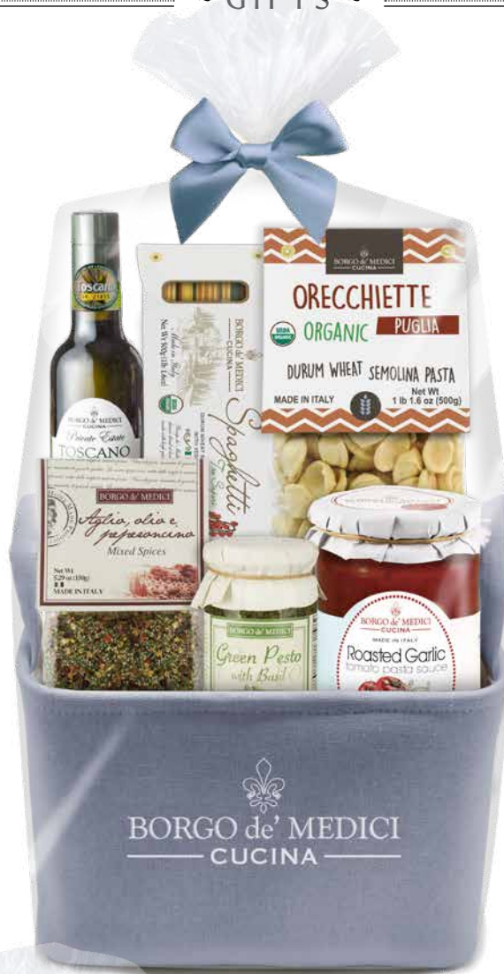
BH2445 LARGE SAVOURY CANVAS BASKET 1 unit/case