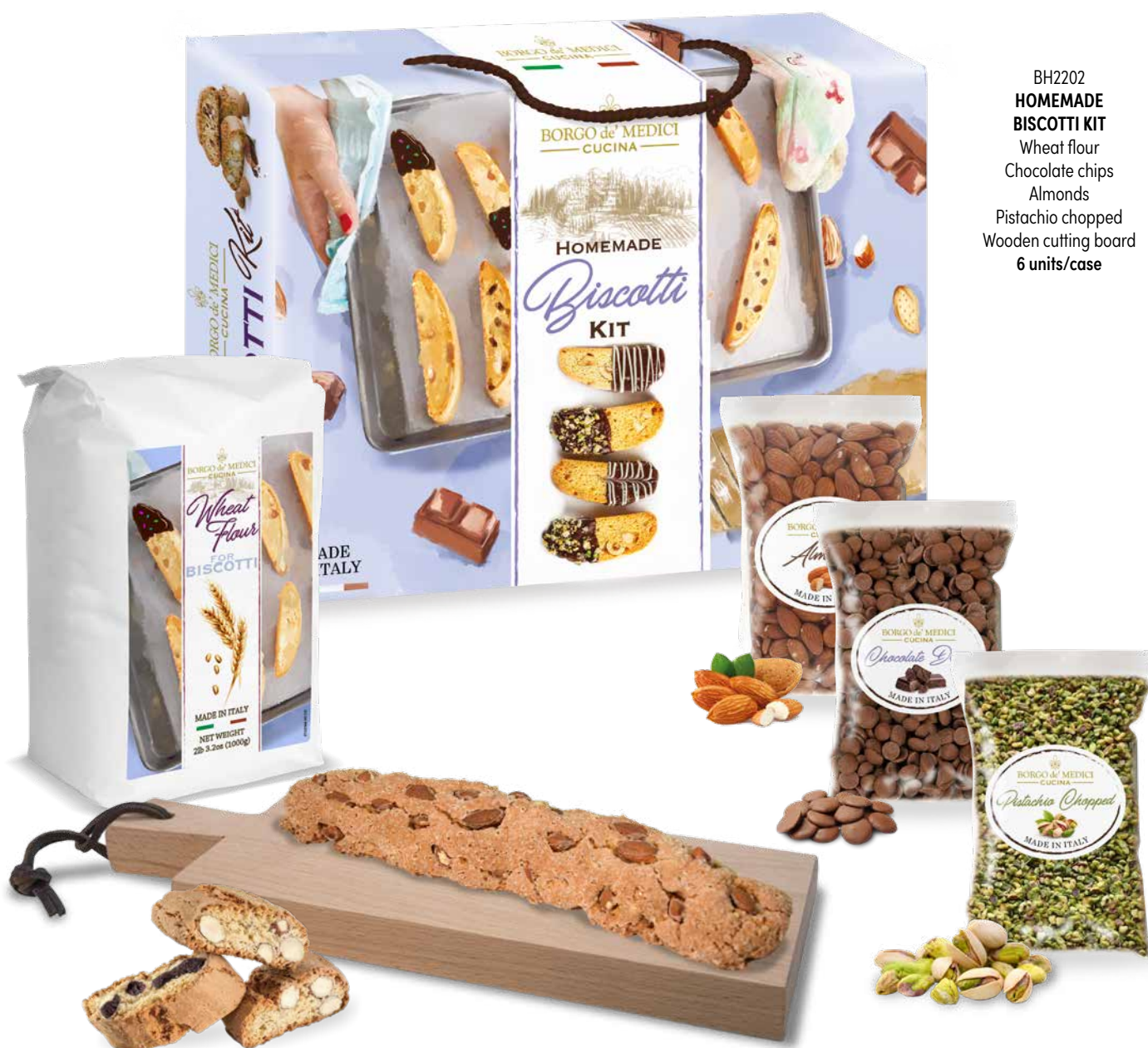
BH2202 HOMEMADE BISCOTTI KIT Wheat flour Chocolate chips Almonds Pistachio chopped Wooden cutting board 6 units/case

The dough is first shaped into a log and baked. After the baked dough log cools, you slice it on the diagonal and bake the cookies a second time until they are crisp. The recipe we give you is so easy and you can make lots of different flavors of biscotti so that there is something everyone will like.