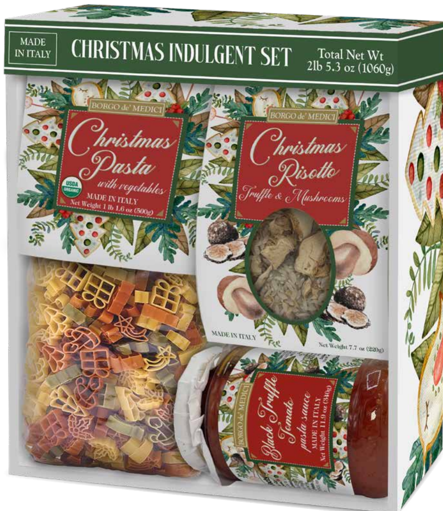
BH2523 ITALIAN CHRISTMAS INDULGENT SET 2 lb + 5.7 oz (1070 g) 6 units/case