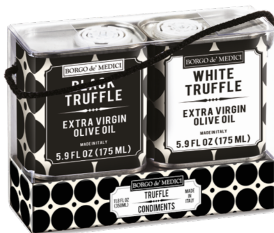
AG00306 DUETTO TRUFFLE EVO IN TINS GIFT BOX

For a gift any truffle lover would cherish, we have gathered products that will be sure to surprise and delight, bringing a touch of truffle magic into their lives.