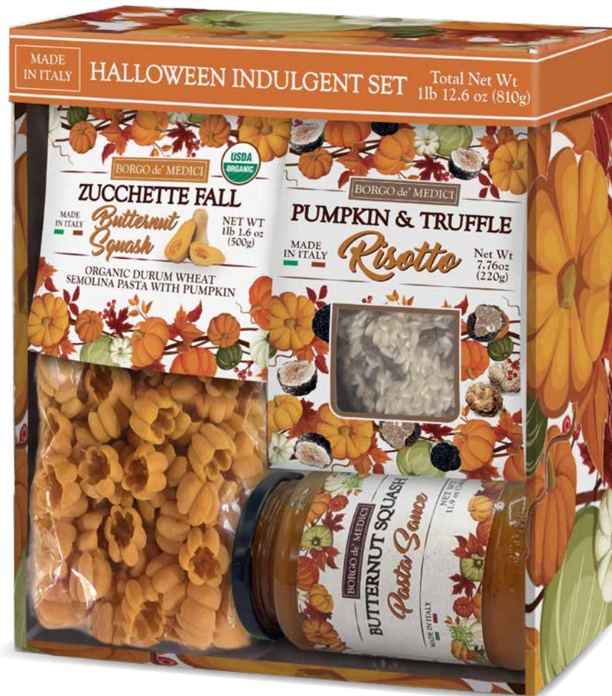
BH2522 ITALIAN FALL INDULGENT SET 2 lb + 5.3 oz (1060 g) 6 units/case