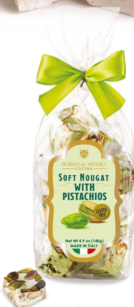
BH2131 PISTACHIO SOFT NOUGAT BITE IN BAG 4.9 oz (120 g) 8 units/case