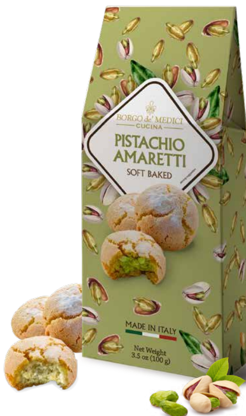
BD2557 PISTACHIO AMARETTI IN BOX 3.5 oz (100g) 12 units/case