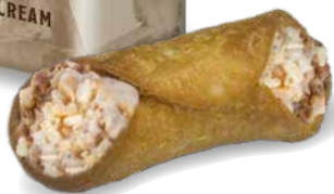
BH2408 CANNOLI STRACCIATELLA CREAM 5.2 oz (150 g) 8 units/case