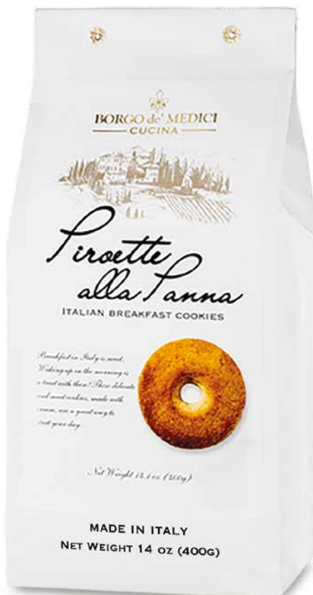
A050603ED PIROETTE ALLA PANNA Breakfast Cookies 14 oz (400g) 12 units/case

A sweet Italian awakening: delicate Piroette alla Panna (Cream Swirls), fragrant Frollini al limoncello (Limoncello Shortbread), and classic Zuccherini (Sugar Cookies). Three delightful treats to start the day with a smile.