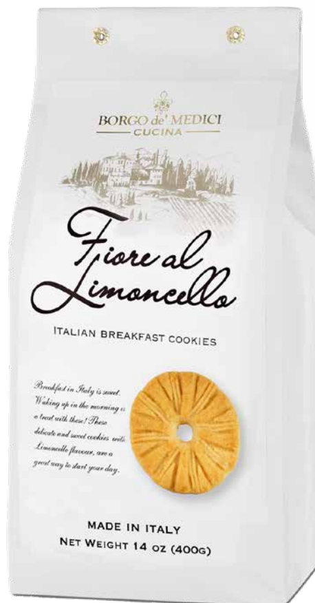
AS01666 FIORE AL LIMONCELLO Breakfast Cookies 14 oz (400g) 12 units/case