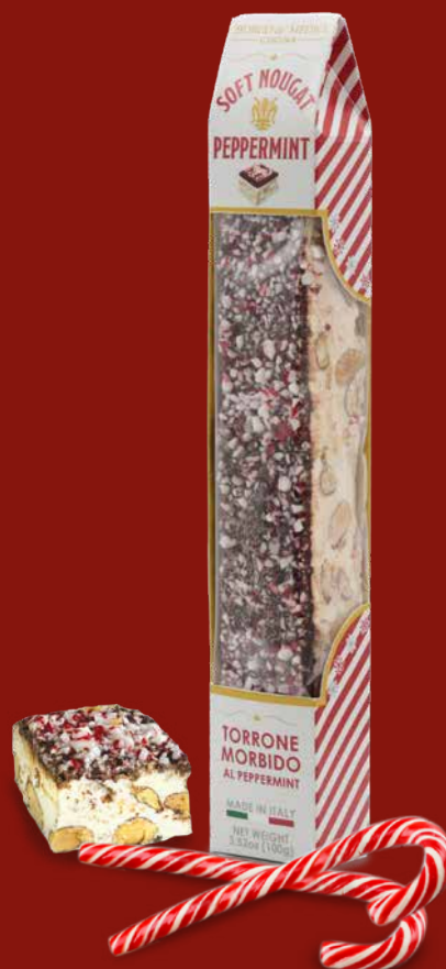
BH2303 SOFT NOUGAT WITH PEPPERMINT BARK 100g 12 unit/case