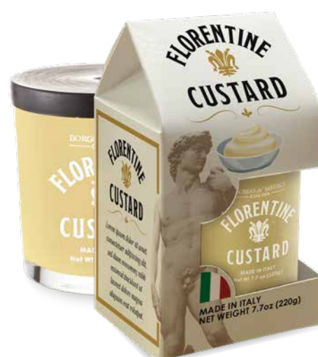
BH2430 FLORENTINE CUSTARD 7.7 oz (220 g) 6 units/case