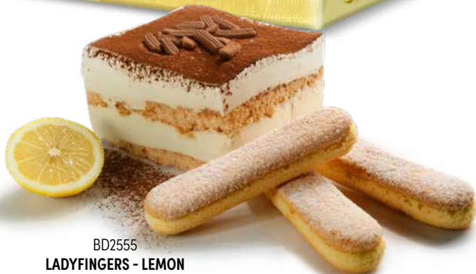
BD2555 LADYFINGERS - LEMON 10.5 oz (300g) 6 units/case