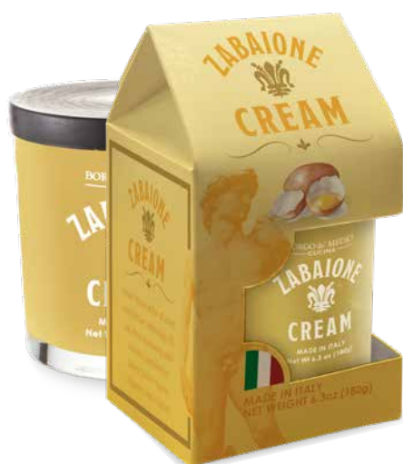
BH2429 ZABAIONE CREAM 6.3 oz (180 g) 6 units/case