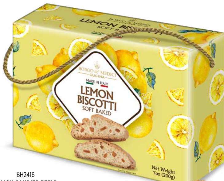
BH2416 LEMON CANDIED PEELS SOFT BISCOTTI 7 oz (200 g) 12 units/case

The result sees the trademark crispness of Cantucci give way to a delicate softness that perfectly wraps itself around a sweet filling. To date, nobody has been able to recreate the mixture that makes these biscotti unique. These are the perfect gift for those looking for something unique and made with only the highest quality ingredients, or as the final course in any Holiday meal.