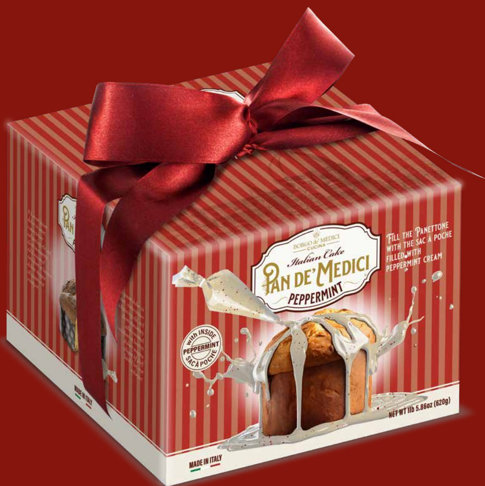
BDMP2404 PAN DE MEDICI CAKE WITH PEPPERMINT BARK CREAM (IN SAC A POCHE) 770g 6 unit/case