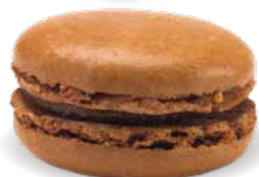
BH2305 HAZELNUT MACARONS 3.1 oz (90g) 12 unit/case