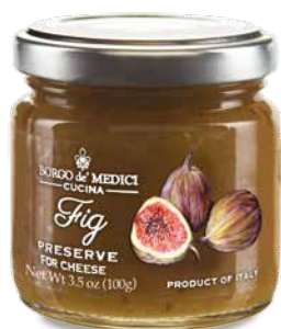
A001027 FIG PRESERVE for Cheese 3.7 oz (105g) 12 units/case