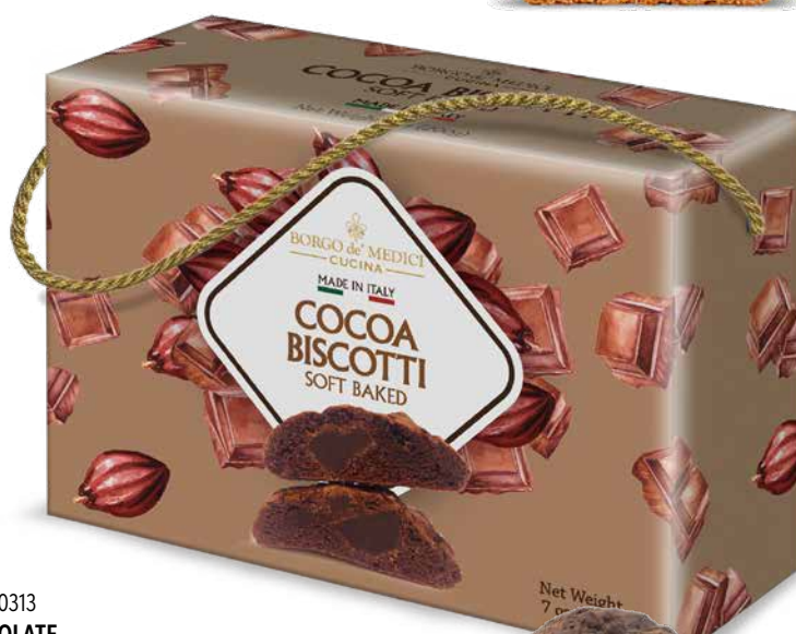
A050313 CHOCOLATE SOFT BAKED BISCOTTI IN BOX 7 oz (200 g) 12 units/case