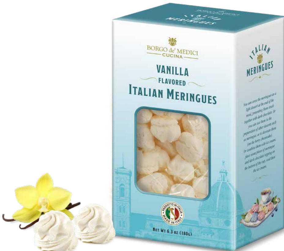
BH2432 VANILLA FLAVORED MERINGUES 6.3 oz (180 g) 12 units/case