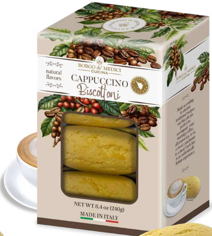
BD2551 CAPPUCCINO BISCOTTONI 8.4 oz (240 g) 6 units/case