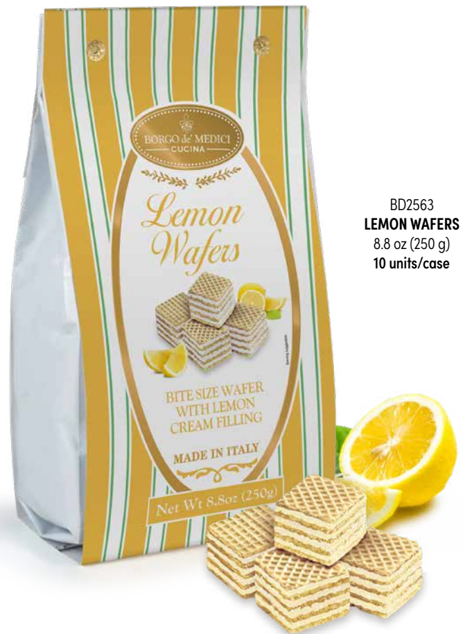
BD2563 LEMON WAFERS 8.8 oz (250 g) 10 units/case