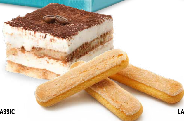
BD2553 LADYFINGERS - CLASSIC 10.5 oz (300g) 6 units/case