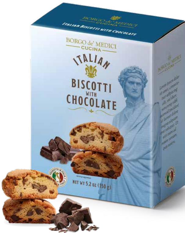
BD2544 CHOCOLATE CRUMBLY BISCOTTI BOX 5.2 oz (150 g) 12 units/case