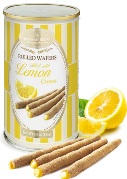
BH2323 LEMON ROLLED WAFERS 4.76 oz (135 g) 12 unit/case

Four irresistible Italian temptations in practical tins: crunchy roller wafers filled with delicious lemon cream, rich chocolate, aromatic cappuccino cream, and tempting salted caramel. A pleasure to enjoy at any time.