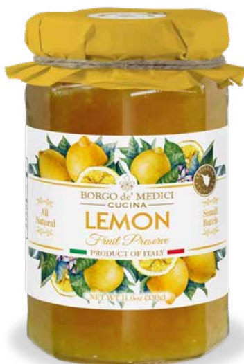
BD2569 LEMON MARMALADE 11.6 oz (330g) 6 units/case