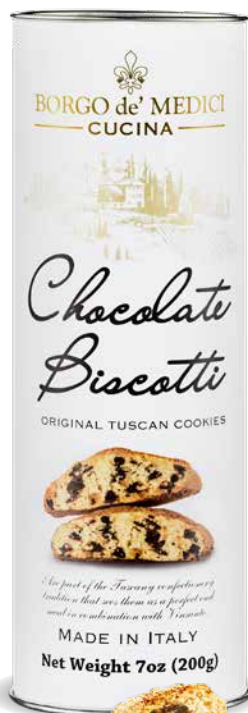
A050.452 CHOCOLATE BISCOTTI IN TUBE 7 oz tube (200 g) 12 units/case

Elegant, hand packed tubes embrace our Italian Biscotti “must have” for holidays. Traditional Biscotti, Almond for classics, Chocolate for the greedies, Limoncello flavored cookies and Crunchy Amaretti presented as a wonderful gift for the holiday.