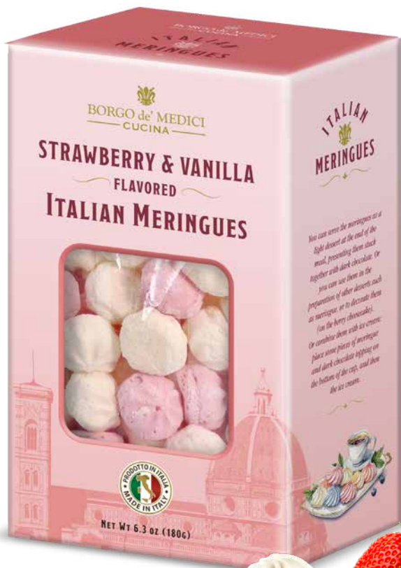
BH2433 STRAWBERRY & VANILLA FLAVORED MERINGUES 6.3 oz (180 g) 12 units/case