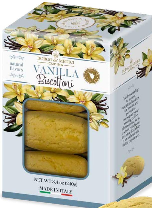
BD2550 VANILLA BISCOTTONI 8.4 oz (240 g) 6 units/case