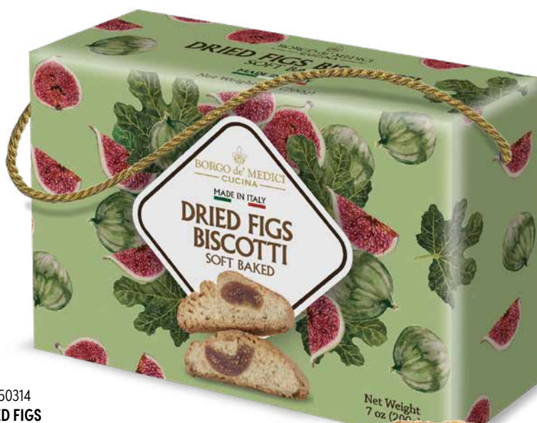
A050314 DRIED FIGS SOFT BAKED BISCOTTI IN BOX 7 oz (200 g) 12 units/case

It is hard to imagine a more fitting finale to a Tuscan meal than Cantucci (commonly called “Biscotti”). Traditionally, they are crunchy and crispy and contain almonds. Our original version is of a Soft Baked Biscotti that is very unique, and is made in the shape of traditional Tuscan Biscotti, but with a unique twist, born, like all great inventions, from a mistake: a secret ingredient.