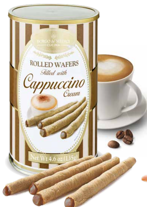
AS02247 CAPPUCCINO ROLLED WAFERS 4.76 oz (135 g) 12 units/case