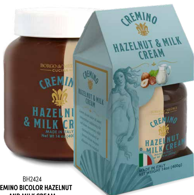
BH2424 CREMINO BICOLOR HAZELNUT AND MILK CREAM 14.1 oz (400 g) 6 units/case