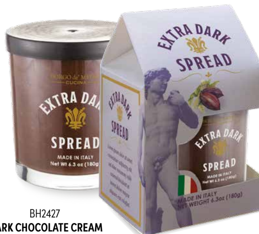
BH2427 DARK CHOCOLATE CREAM 6.3 oz (180 g) 6 units/case