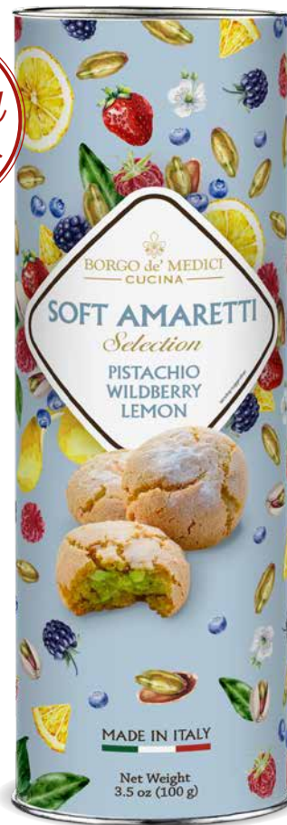
BD2560 ASSORTED AMARETTI IN TUBE 10.5 oz (300g) 12 units/case