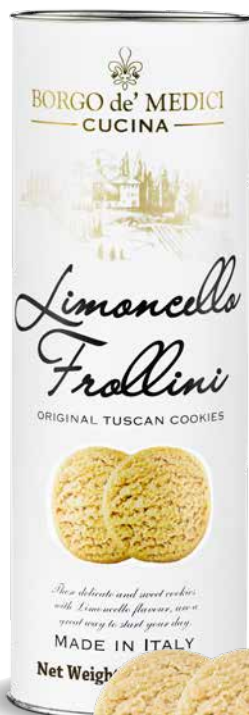
AS01664 LIMONCELLO ITALIAN SHORTBREADS IN TUBE 6.35 oz tube (180 g) 12 units/case