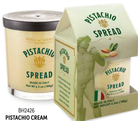
BH2426 PISTACHIO CREAM 6.3 oz (180 g) 6 units/case