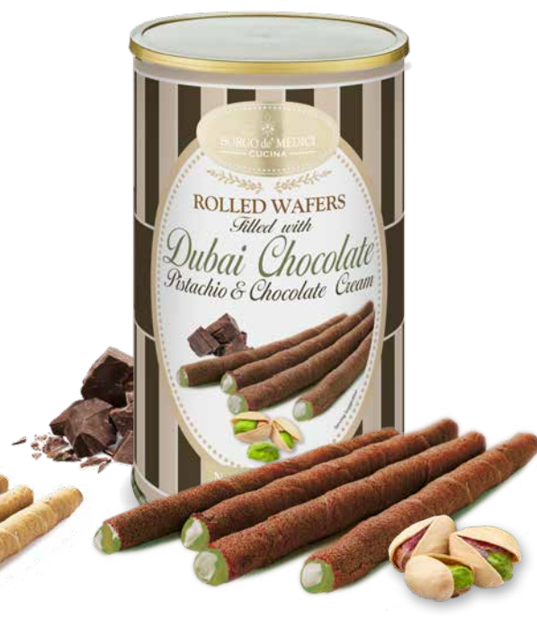
BD2570 DUBAI CHOCOLATE ROLLED WAFERS 4.76 oz (135 g) 12 units/case