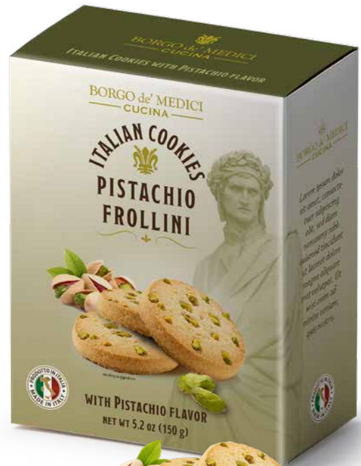
BD2548 PISTACHIO CRUMBLY COOKIES BOX 5.2 oz (150 g) 12 units/case