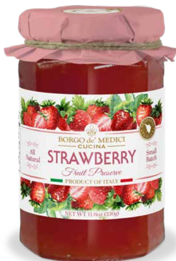
BD2503 STRAWBERRY JAM 11.6 oz (330g) 6 units/case