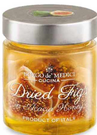
A093018 DRIED FIGS IN ACACIA HONEY from tuscany 6.8 oz (195g) 6 units/case