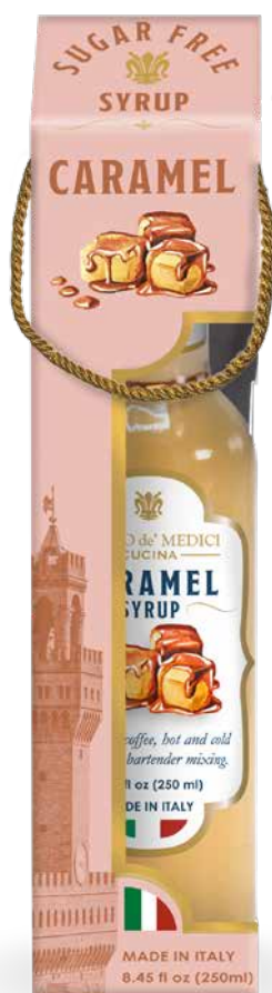
BH2120 CARAMEL SUGAR FREE COFFEE SYRUP 8.45 fl oz (250 ml) 12 units/case

A touch of sweetness for your favorite drinks. Three Italian syrups in the classic flavors of rich caramel, fragrant hazelnut, and delicate vanilla. Presented in elegant packaging, also perfect as a gift idea for everyday enjoyment.