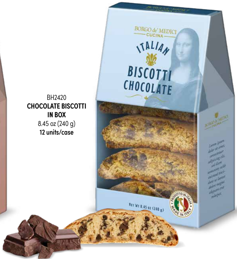
BH2420 CHOCOLATE BISCOTTI IN BOX 8.45 oz (240 g) 12 units/case