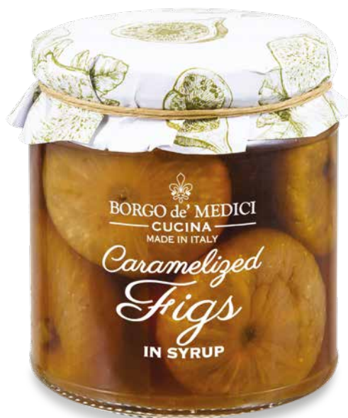
A108011ED CARAMELIZED FIGS IN SYRUP 11.28 oz (320 g) 6 units/case