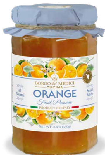
BD2568 ORANGE MARMALADE 11.6 oz (330g) 6 units/case