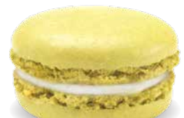
BH2404 LEMON MACARONS 3.1 oz (90g) 12 units/case