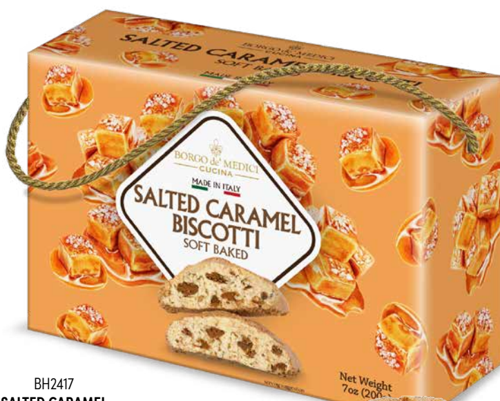
BH2417 SALTED CARAMEL SOFT BISCOTTI 7 oz (200 g) 12 units/case