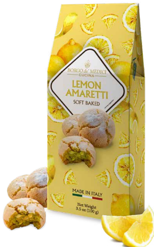
BD2558 LEMON AMARETTI IN BOX 3.5 oz (100g) 12 units/case