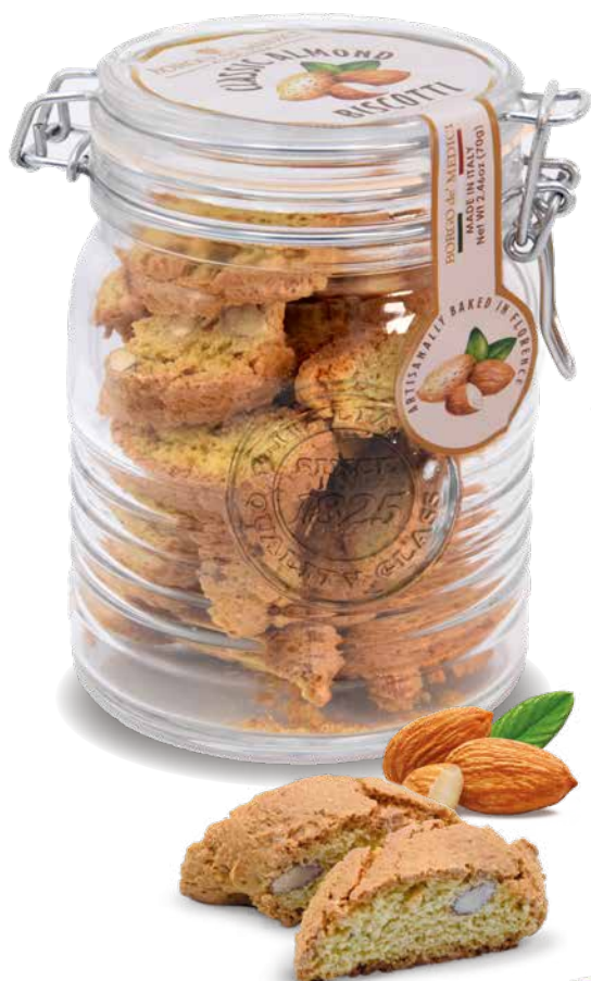
BH2110 ALMOND BISCOTTI IN JAR (individually wrapped inside) 7 oz (200g) 6 units/case

Fine Tuscan pastry individually wrapped, contained in an elegant Bormioli Officina Glass Jar made in Italy