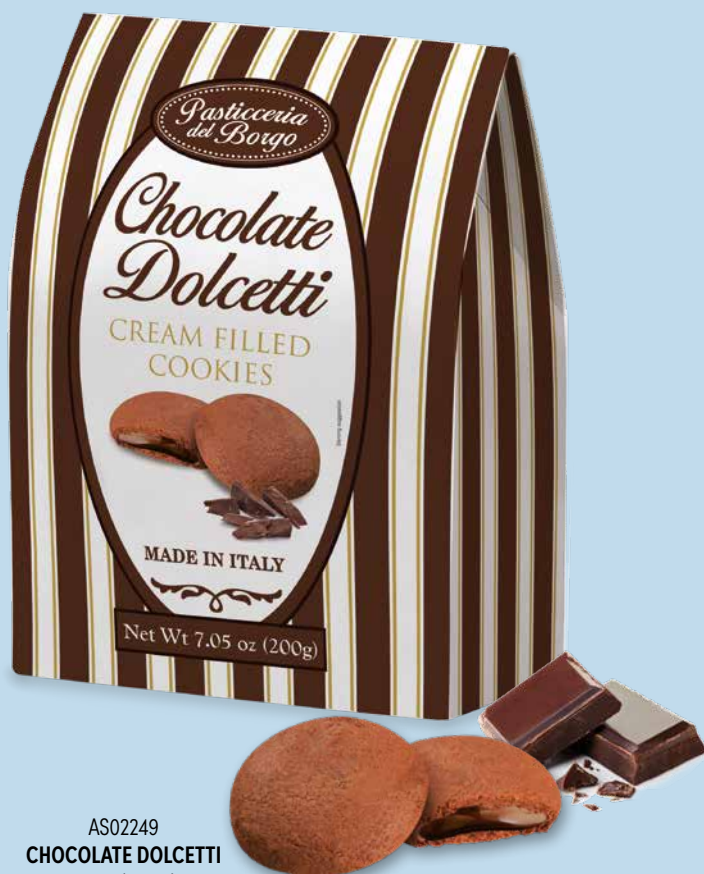
AS02249 CHOCOLATE DOLCETTI 7.0 oz (200 g) 12 units/case

A soft heart enclosed in a fragrant embrace: delicious round biscuits with a delectable filling of rich dark chocolate and enveloping hazelnut cream. A small pleasure that melts the heart.