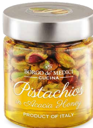
A093015 PISTACHIOS IN ACACIA HONEY from tuscany 6.8 oz (195g) 6 units/case