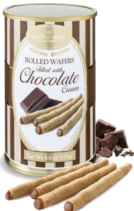
AS02246 CHOCOLATE ROLLED WAFERS 4.76 oz (135 g) 12 units/case