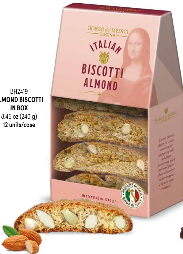
BH2419 ALMOND BISCOTTI IN BOX 8.45 oz (240 g) 12 units/case