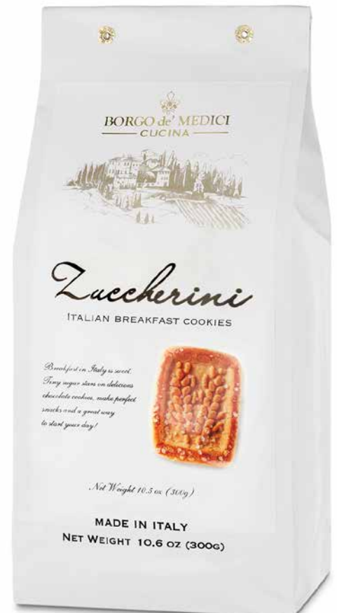
A050601ED ZUCCHERINI Breakfast Cookies 14 oz (400g) 12 units/case