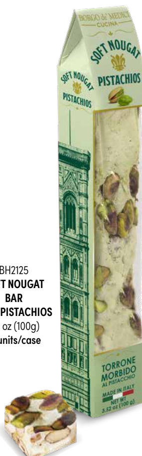
BH2125 SOFT NOUGAT BAR WITH PISTACHIOS 3.5 oz (100g) 12 units/case