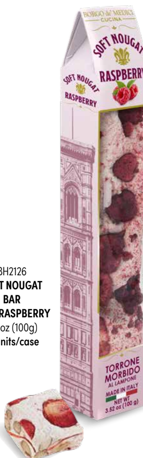
BH2126 SOFT NOUGAT BAR WITH RASPBERRY 3.5 oz (100g) 12 units/case