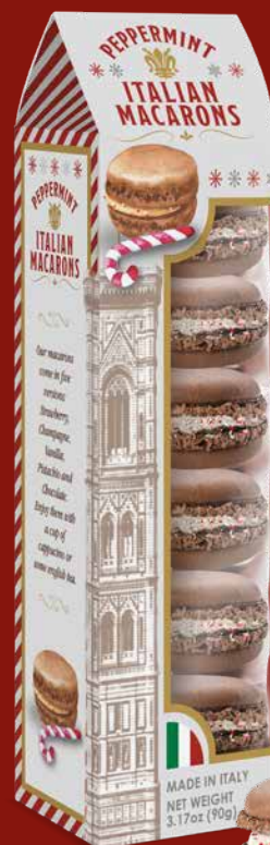
BH2301 PEPPERMINT BARK MACARONS 90g 12 unit/case

When the Christmas holidays arrive it is traditional to enjoy peppermint sweets. We have created three exciting products: macarons, biscuits, white chocolate topped with crushed candy canes... perfect for parties and gifts.