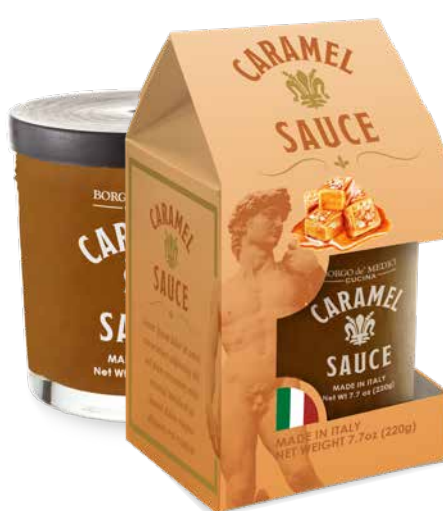
BH2431 CARAMEL SAUCE 7.7 oz (220 g) 6 units/case