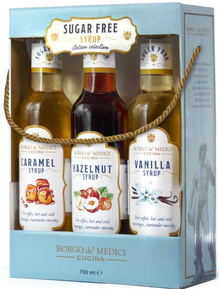
BH2235 TRIS SET SUGAR FREE COFFEE SYRUP 25.36 fl oz (750 ml) 6 units/case