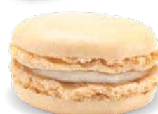
BH2133 VANILLA MACARONS 3.1 oz (90g) 12 units/case