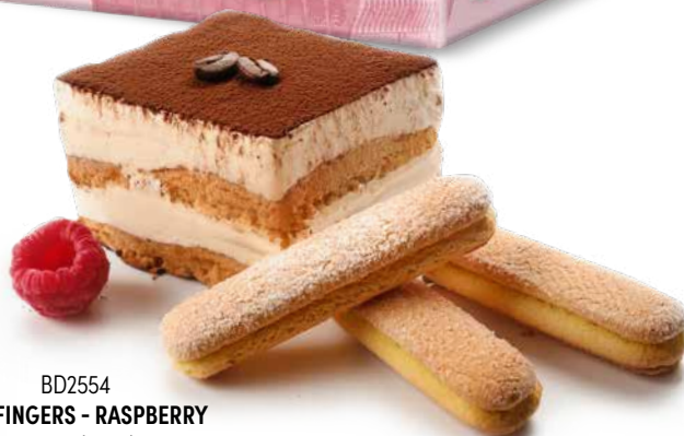
BD2554 LADYFINGERS - RASPBERRY 10.5 oz (300g) 6 units/case