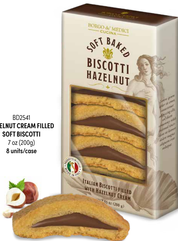
BD2541 HAZELNUT CREAM FILLED SOFT BISCOTTI 7 oz (200g) 8 units/case