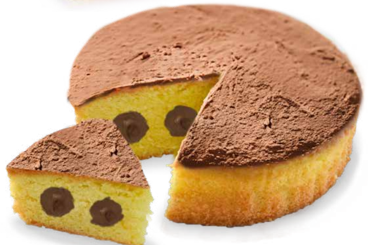
BH2422 TIRAMISÙ CREAM SOFT CAKE 14.1 oz (400 g) 12 units/case