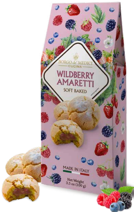
BD2559 WILDBERRIES AMARETTI IN BOX 3.5 oz (100g) 12 units/case