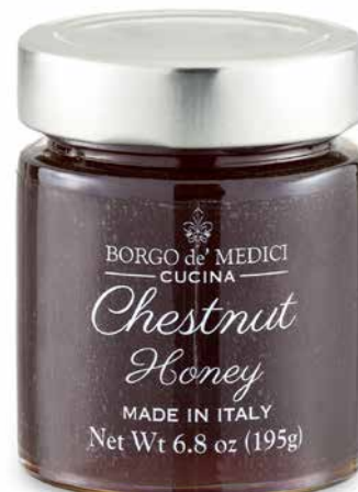
AS01674 CHESTNUT HONEY from tuscany 6.8 oz (195g) 6 units/case