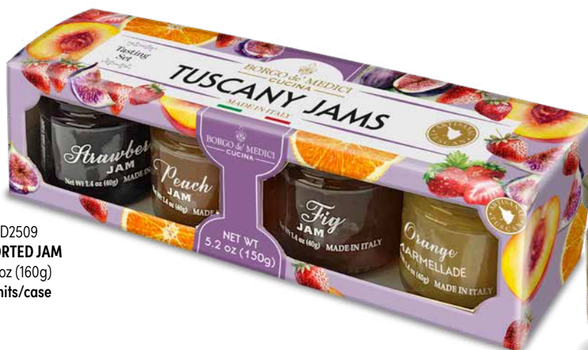
BD2509 ASSORTED JAM 5.6 oz (160g) 6 units/case