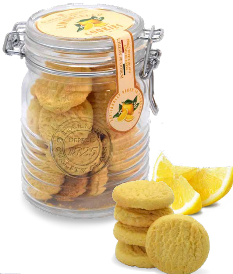
BH2112 LIMONCELLO FLAVORED FROLLINI - TEA COOKIES IN JAR (individually wrapped inside) 7 oz (200g) 6 units/case