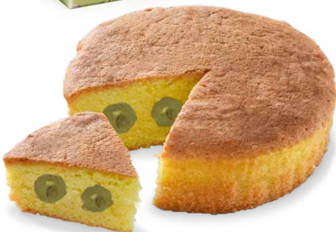
BH2423 PISTACHIO CREAM SOFT CAKE 14.1 oz (400 g) 12 units/case