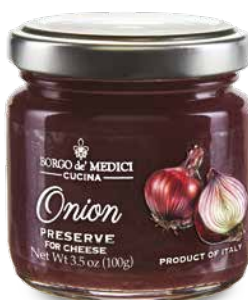
A001028 ONION PRESERVE for Cheese 3.7 oz (105g) 12 units/case