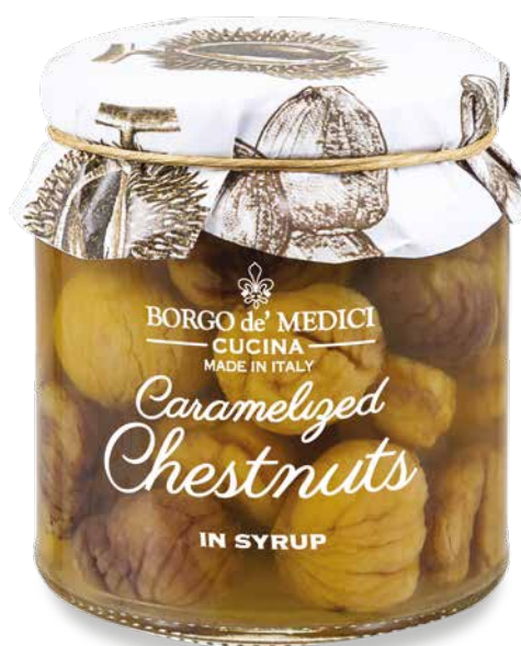
A108012ED CARAMELIZED CHESTNUTS IN SYRUP 12.34 oz (350 g) 6 units/case