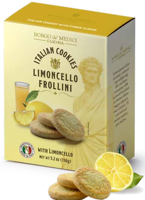
BD2549 LIMONCELLO CRUMBLY COOKIES BOX 5.2 oz (150 g) 12 units/case