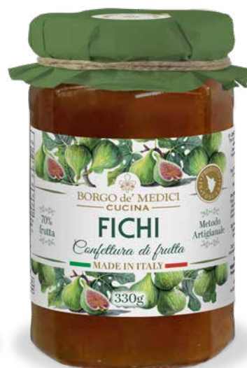
BD2567 FIGS JAM 11.6 oz (330g) 6 units/case