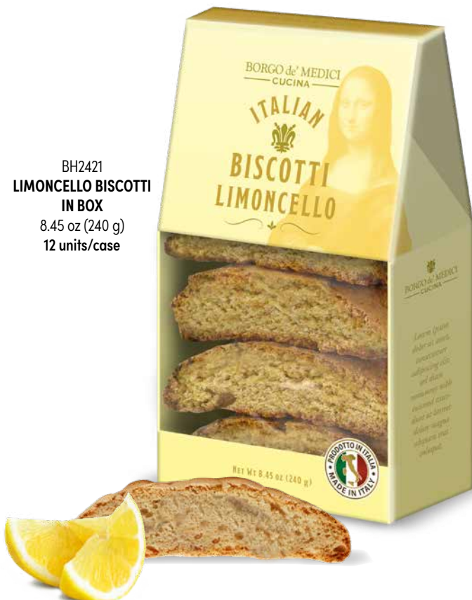
BH2421 LIMONCELLO BISCOTTI IN BOX 8.45 oz (240 g) 12 units/case