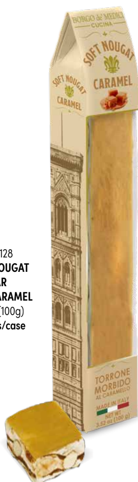
BH2128 SOFT NOUGAT BAR WITH CARAMEL 3.5 oz (100g) 12 units/case