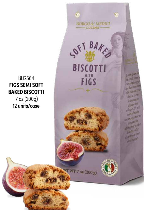
BD2564 FIGS SEMI SOFT BAKED BISCOTTI 7 oz (200g) 12 units/case