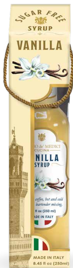
BH2118 VANILLA SUGAR FREE COFFEE SYRUP 8.45 fl oz (250 ml) 12 units/case