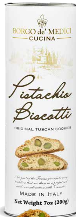
BD2539 PISTACHIO BISCOTTI IN TUBE 7 oz tube (200 g) 12 units/case