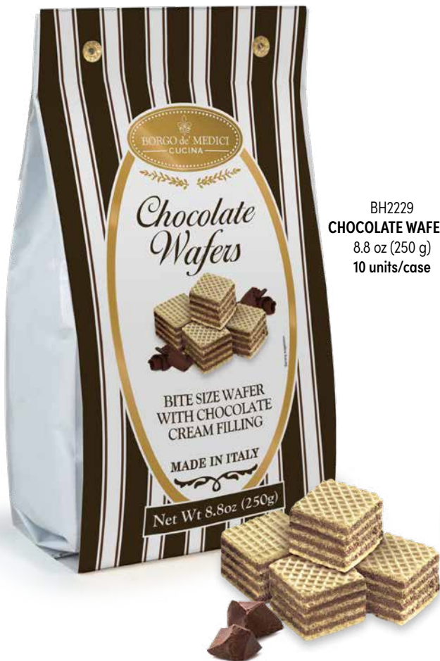
BH2229 CHOCOLATE WAFERS 8.8 oz (250 g) 10 units/case