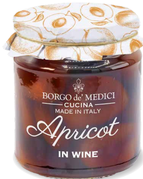
BH2435 APRICOTS IN ITALIAN RED WINE 12.34 oz (350 g) 6 units/case