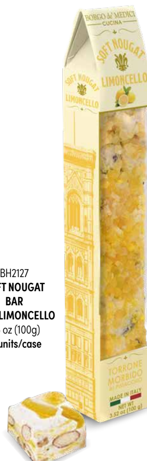
BH2127 SOFT NOUGAT BAR WITH LIMONCELLO 3.5 oz (100g) 12 units/case