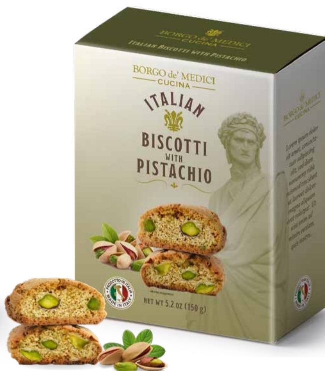
BD2546 PISTACHIO CRUMBLY BISCOTTI BOX 5.2 oz (150 g) 12 units/case