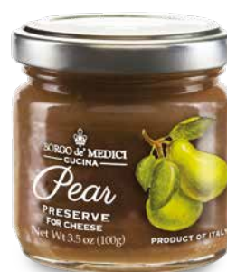
A001026 PEAR PRESERVE for Cheese 3.7 oz (105g) 12 units/case