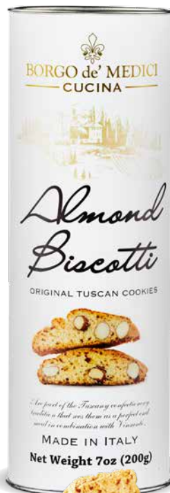
A050.451 ALMOND BISCOTTI IN TUBE 7 oz tube (200 g) 12 units/case