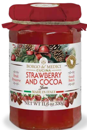
BH2507 STRAWBERRY & COCOA 11.6 oz (330g) 6 units/case