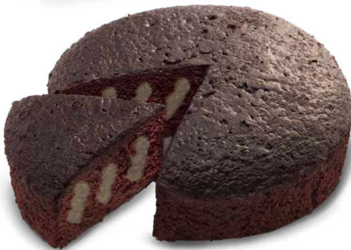
BH2113 TUSCAN PEAR & CHOCOLATE CAKE 14.1 oz (400 g) 6 units/case