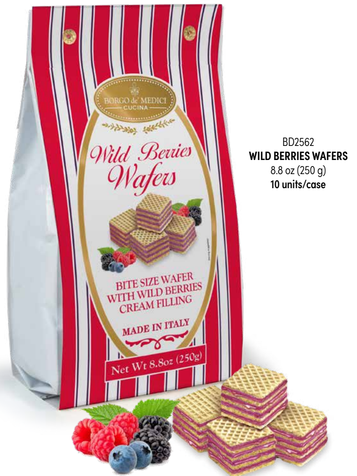
BD2562 WILD BERRIES WAFERS 8.8 oz (250 g) 10 units/case