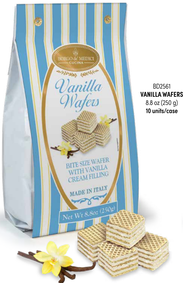
BD2561 VANILLA WAFERS 8.8 oz (250 g) 10 units/case