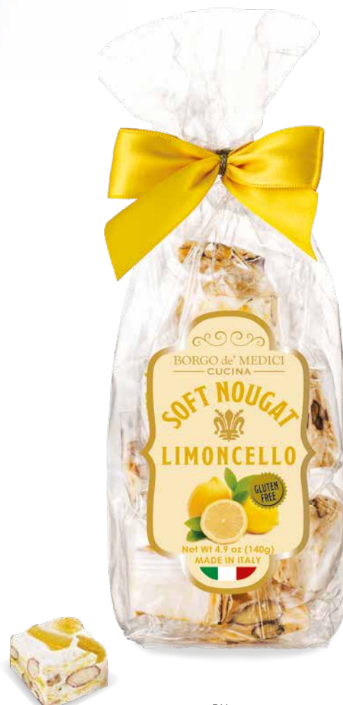
BH2132 LIMONCELLO SOFT NOUGAT BITE IN BAG 4.9 oz (120 g) 8 units/case