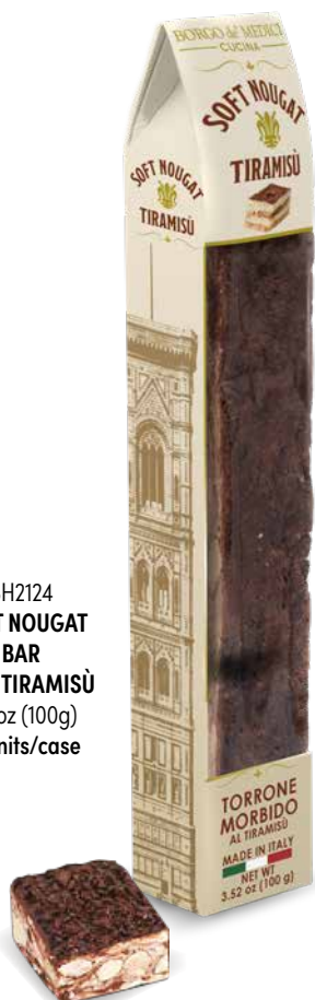
BH2124 SOFT NOUGAT BAR WITH TIRAMISÙ 3.5 oz (100g) 12 units/case