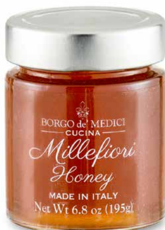
AS01673 MILLEFIORI HONEY from tuscany 6.8 oz (195g) 6 units/case