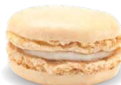
BH2136 CHAMPAGNE MACARONS 3.1 oz (90g) 12 units/case