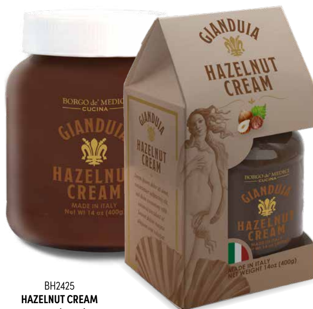
BH2425 HAZELNUT CREAM 14.1 oz (400 g) 6 units/case