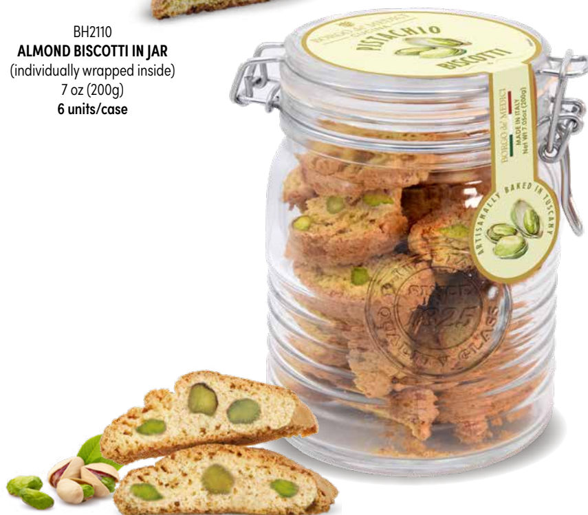
BH2510 PISTACCHIO BISCOTTI IN JAR 7 oz (200g) 6 units/case