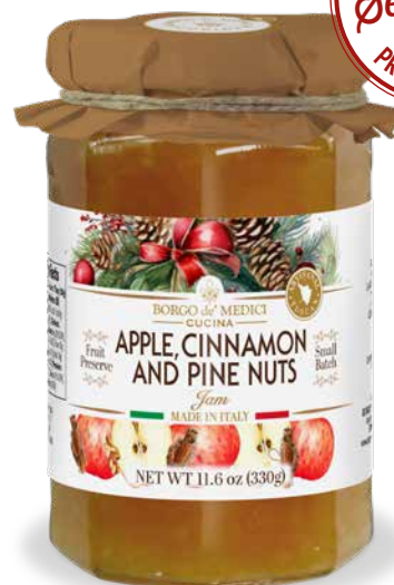
BH2508 APPLE, CINNAMON & PINE SEEDS 11.6 oz (330g) 6 units/case