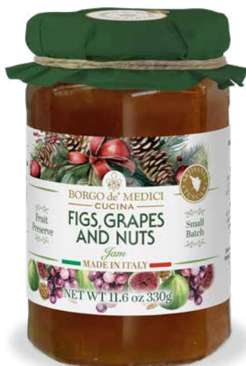
BH2506 FIGS, GRAPES & NUTS 11.6 oz (330g) 6 units/case