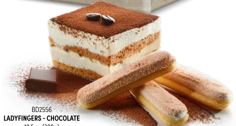
BD2556 LADYFINGERS - CHOCOLATE 10.5 oz (300g) 6 units/case