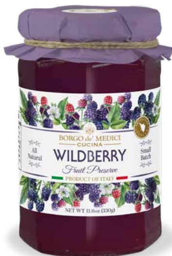
BD2502 WILDBERRY JAM 11.6 oz (330g) 6 units/case