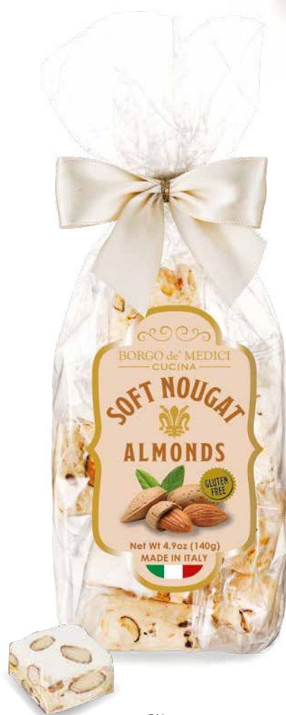
BH2130 ALMOND SOFT NOUGAT BITE IN BAG 4.9 oz (120 g) 8 units/case