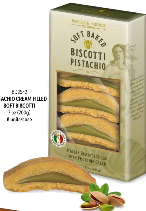
BD2542 PISTACHIO CREAM FILLED SOFT BISCOTTI 7 oz (200g) 8 units/case