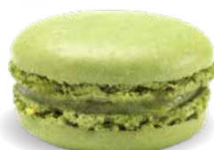
BH2135 PISTACHIO MACARONS 3.1 oz (90g) 12 units/case