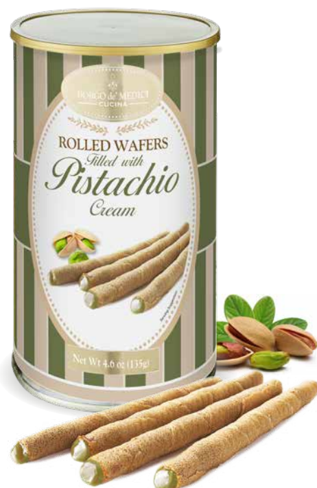
BD2571 PISTACHIO ROLLED WAFERS 4.76 oz (135 g) 12 unit/case