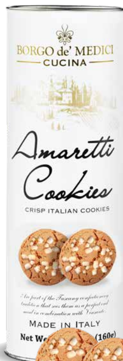
BH2452 AMARETTI COOKIES IN TUBE 5.64 oz tube (160 g) 12 units/case