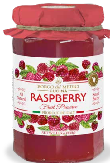
BD2504 RASPBERRY JAM 11.6 oz (330g) 6 units/case