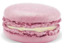
BH2134 STRAWBERRY MACARONS 3.1 oz (90g) 12 units/case