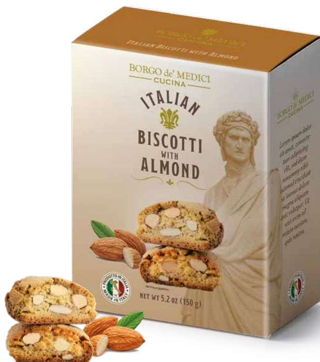
BD2545 ALMOND CRUMBLY BISCOTTI BOX 5.2 oz (150 g) 12 units/case

a sweet break, and the classic cantucci, with their unmistakable crunch and ideal for enjoying with a good dessert wine. A small artisanal pleasure to satisfy every craving.