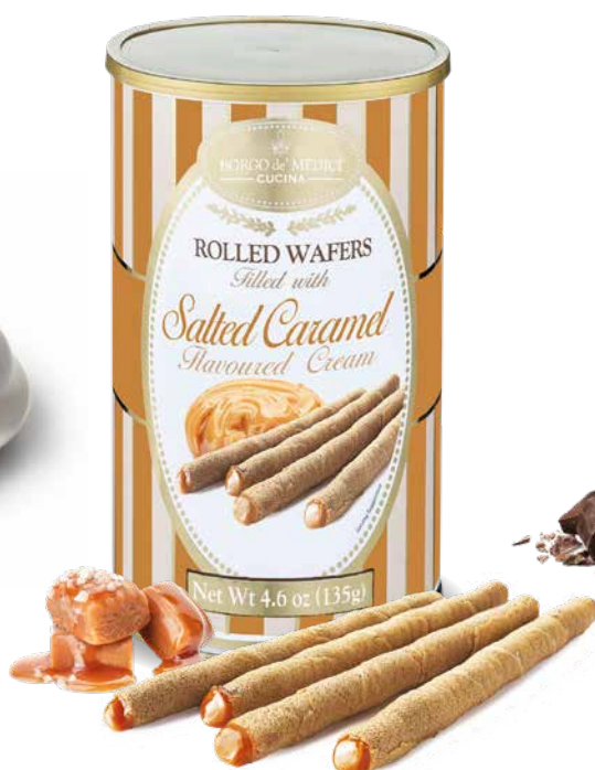
AS02248 SALTED CARAMEL ROLLED WAFERS 4.76 oz (135 g) 12 units/case