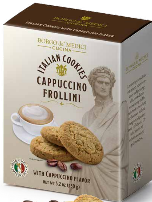
BD2547 CAPPUCCINO CRUMBLY COOKIES BOX 5.2 oz (150 g) 12 units/case