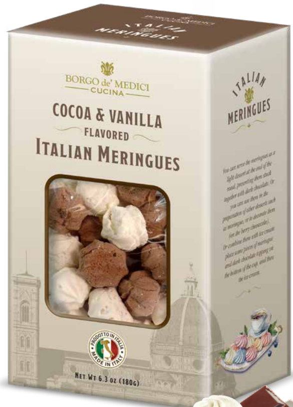
BH2434 CACAO & VANILLA FLAVORED MERINGUES 6.3 oz (180 g) 12 units/case