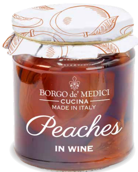
BH2436 PEACHES IN ITALIAN RED WINE 11.28 oz (320 g) 6 units/case

The best peaches and apricots, selected with meticulous care from our harvests, made even more refined and precious by the addition of extremely delicious Italian wine, such as Moscato.