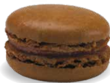
BH2306 CHOCOLATE MACARONS 3.1 oz (90g) 12 unit/case