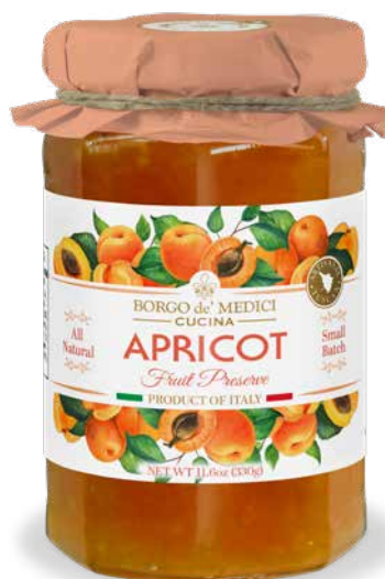
BD2501 APRICOT JAM 11.6 oz (330g) 6 units/case