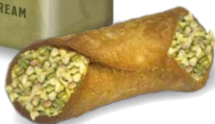
BH2407 CANNOLI LIMONE CREAM 5.2 oz (150 g) 8 units/case