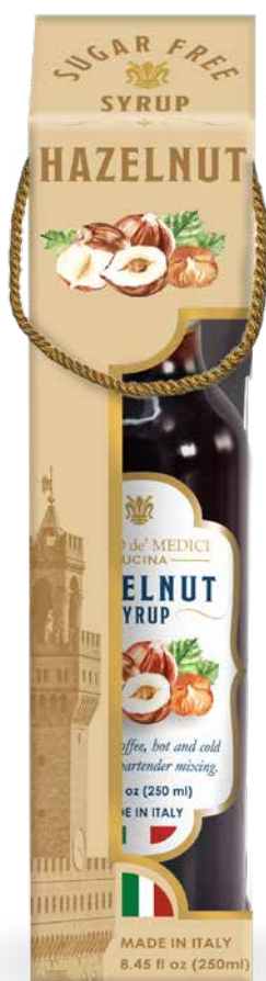
BH2119 HAZELNUT SUGAR FREE COFFEE SYRUP 8.45 fl oz (250 ml) 12 units/case