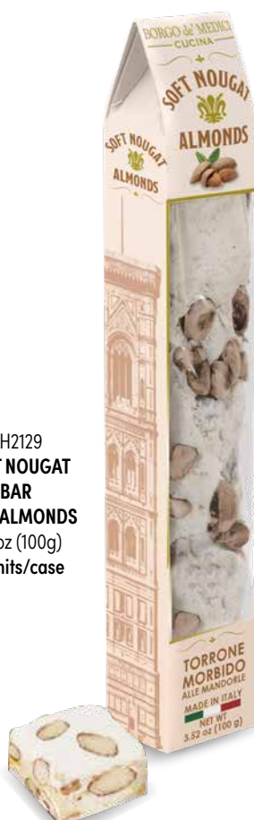
BH2129 SOFT NOUGAT BAR WITH ALMONDS 3.5 oz (100g) 12 units/case