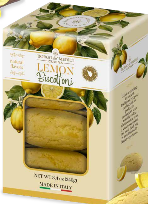
BD2552 LEMON BISCOTTONI 8.4 oz (240 g) 6 units/case