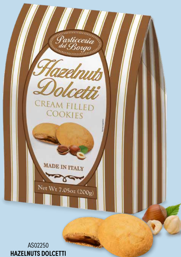
AS02250 HAZELNUTS DOLCETTI 7.0 oz (200 g) 12 units/case