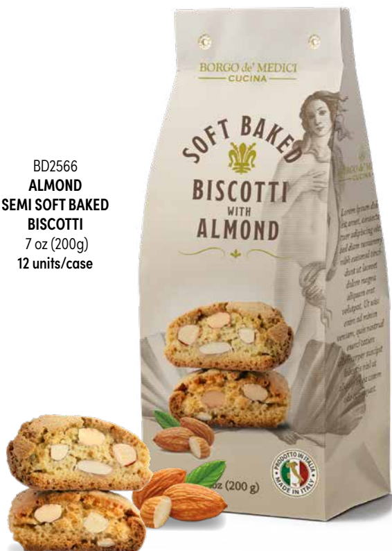
BD2566 ALMOND SEMI SOFT BAKED BISCOTTI 7 oz (200g) 12 units/case