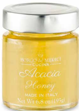
AS01672 ACACIA HONEY from tuscany 6.8 oz (195g) 6 units/case

Three unique Italian honeys: delicate acacia, harmonious wildflower, and intense chestnut. Two delicious specialties: honey with dried figs and honey with pistachios. An authentic taste of Italian sweetness.