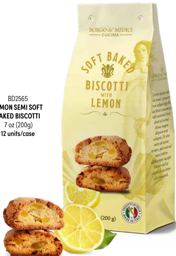
BD2565 LEMON SEMI SOFT BAKED BISCOTTI 7 oz (200g) 12 units/case